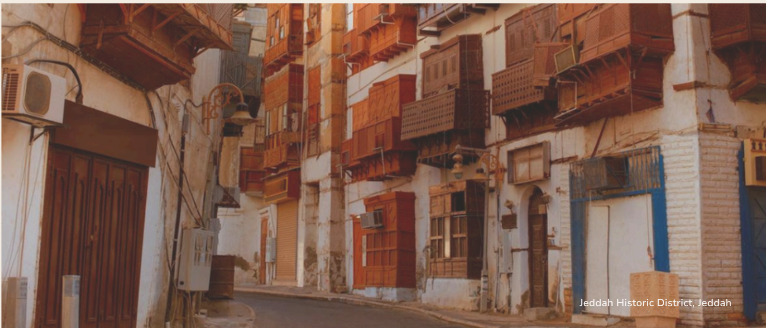
Jeddah Historic District, Jeddah

Enjoy a welcome dinner at the Al-Nakheel restaurant .