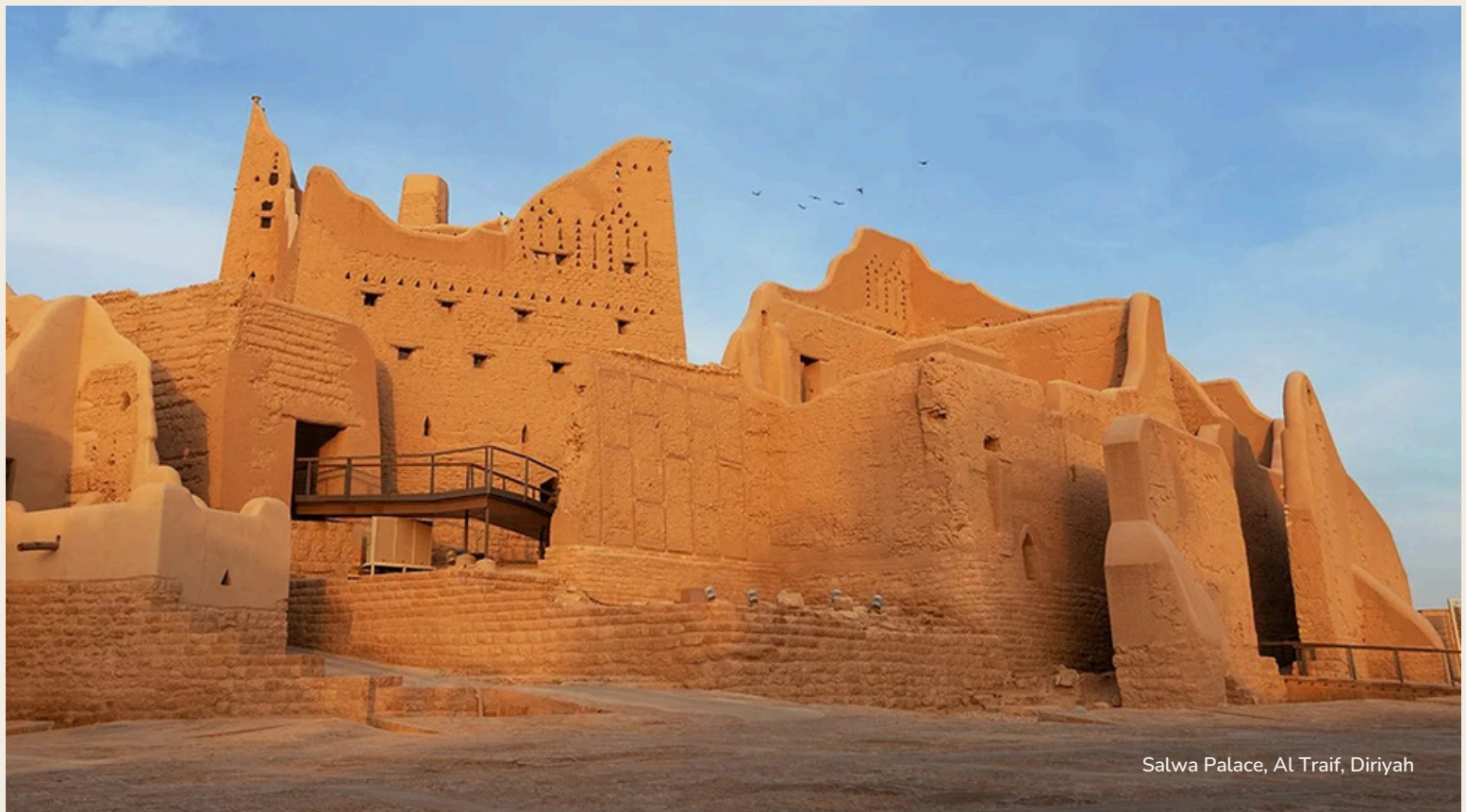
Salwa Palace, Al Traif, Diriyah