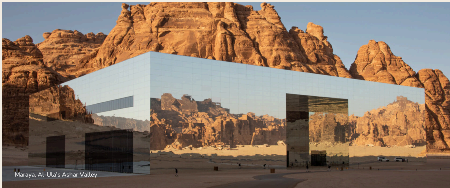
Maraya, Al-Ula's Ashar Valley