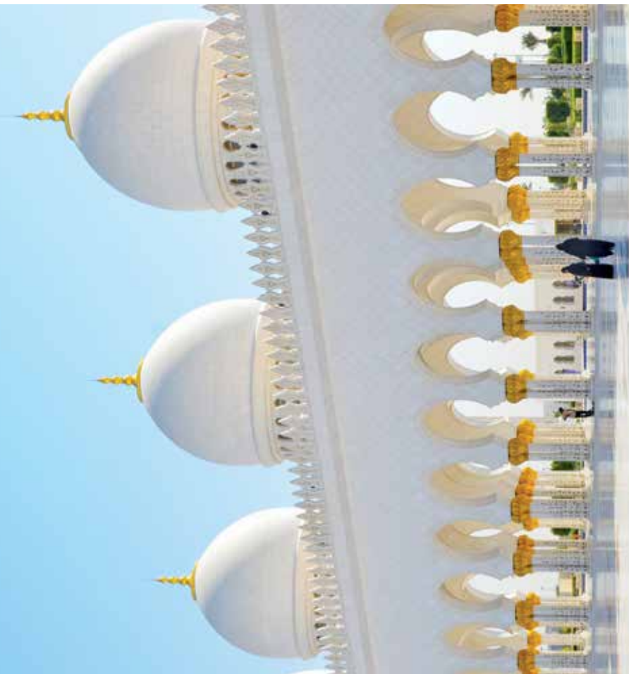
Sheikh Zayed Grand Mosque, Abu Dhabi, UAE