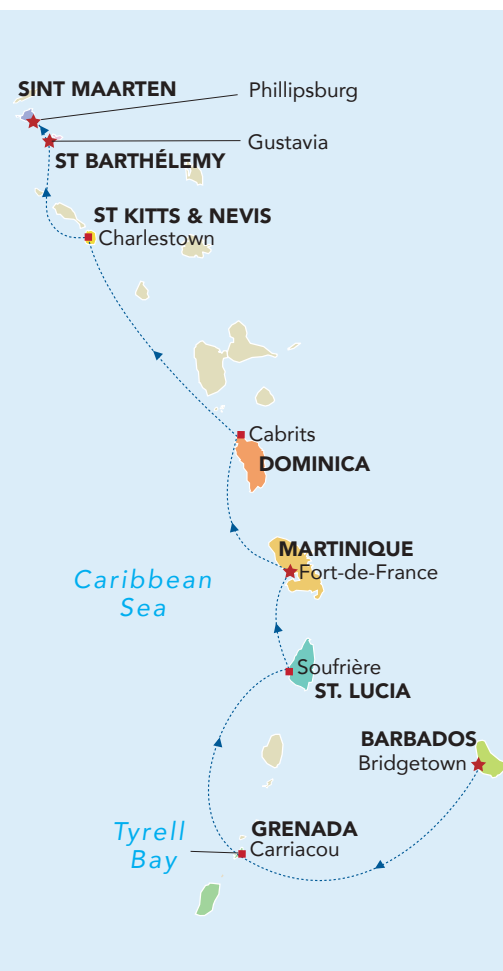
Map of the region

Dominica's Fort Shirley, a restored 18th-century British garrison, commands sweeping views over Prince Rupert Bay, while the island's Kalinago Territory preserves the traditions of the Caribbean's Indigenous navigators. Enjoy further exploration on Nevis, birthplace of Alexander Hamilton, and glamorous St. Barths, where local galleries display contemporary art alongside designer boutiques overlooking pristine harbors.