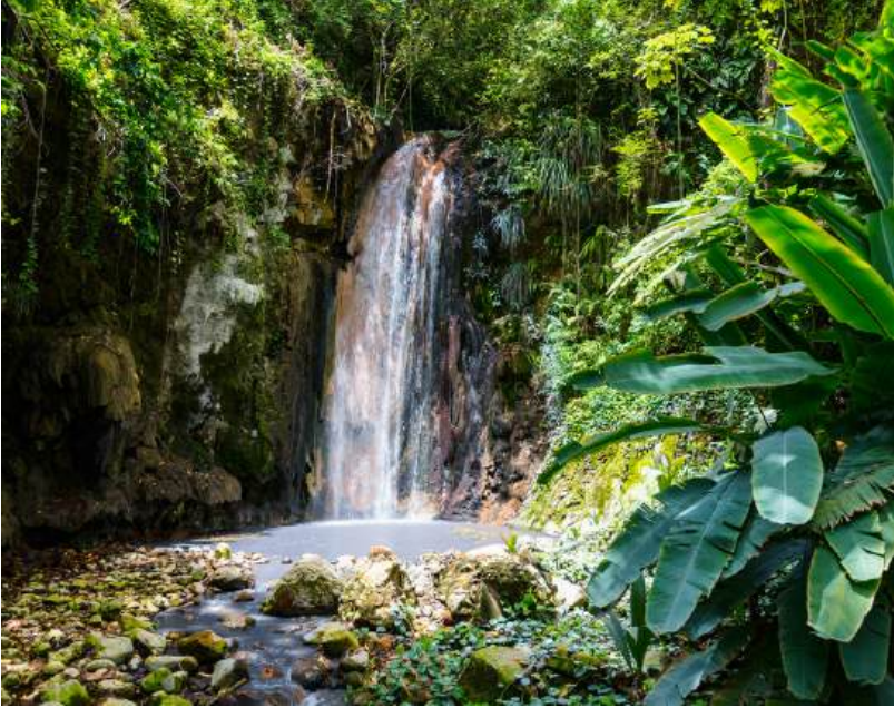
Diamond Waterfall, St. Lucia