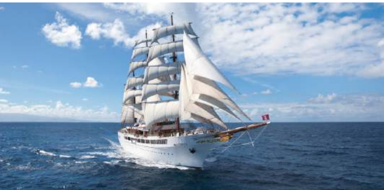
Sea Cloud II

Sea Cloud II is a three-masted sailing yacht steeped in the elegance of yesteryear and complemented with the most modern amenities. Sister ship of the legendary Sea Cloud , Sea Cloud II has 47 outside cabins and travels under 23 billowing sails trimmed by hand. From the mahogany-paneled library and gracious lounge to the gym and watersports platform, no detail has been overlooked. Praised by the world's most discerning travelers, Sea Cloud II receives consistently high rankings from Condé Nast Traveler . Passengers enjoy open seating at all meals and complimentary use of all water sports equipment. A doctor is on call 24 hours a day. Please note that there is no elevator on Sea Cloud II .