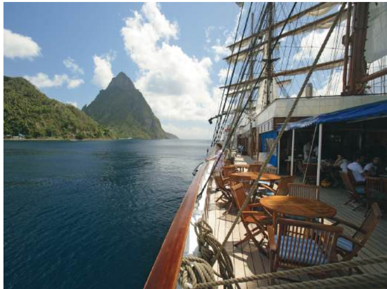
Sea Cloud II Junior Suite (top) and Lido Deck (above)