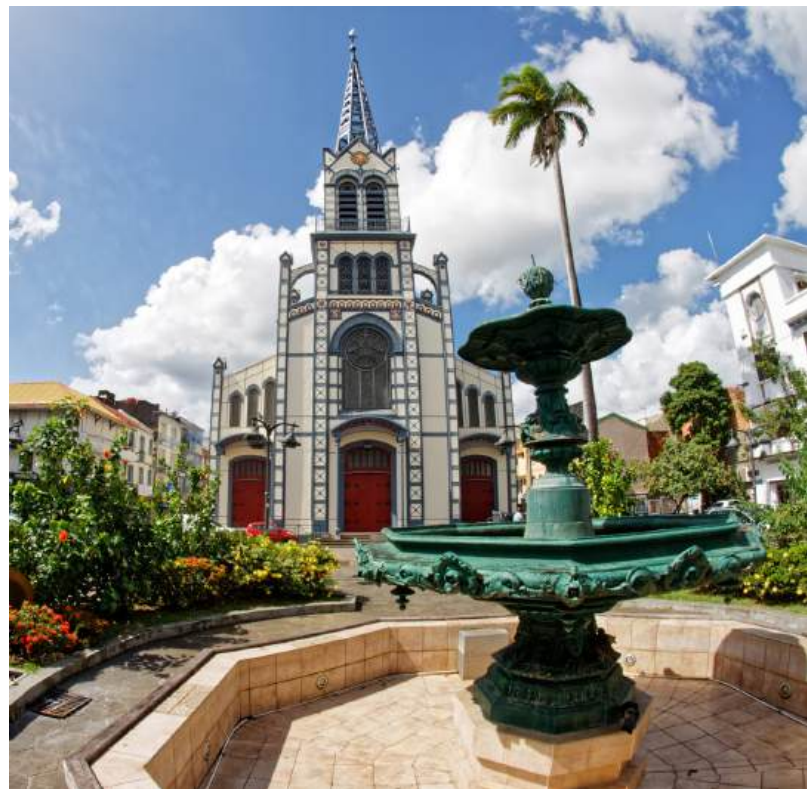
Saint-Louis Cathedral, Fort-de-France, Martinique

Option 1: Join a guided exploration of the restored 18th-century British garrison, Fort Shirley . Learn the story of the 8th West India Regiment, composed of African slave soldiers who took control of the garrison. Their protest led directly to the British Mutiny Act of 1807 and the emancipation of all enslaved soldiers in the British Army. Then meet an expert for a walk through the island's botanical garden.