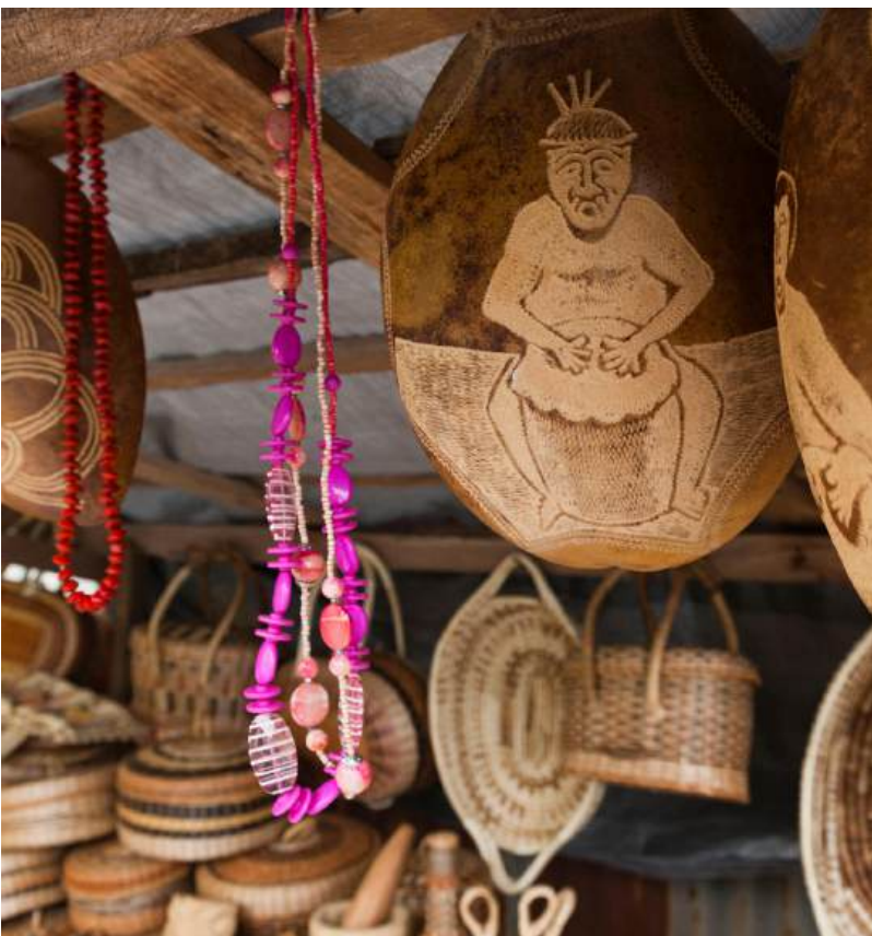
Traditional crafts at Kalinago Territory, Dominica

DISCLAIMER: This itinerary is subject to change at the discretion of Arrangements Abroad. For complete details, please carefully read the terms and conditions at www.arrangementsabroad.com/terms .