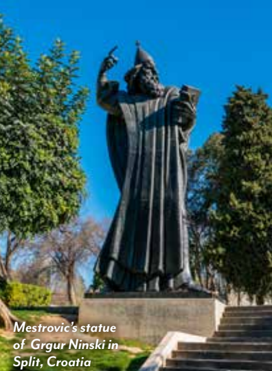
Mestrovic's statue of Grgur Ninski in Split, Croatia