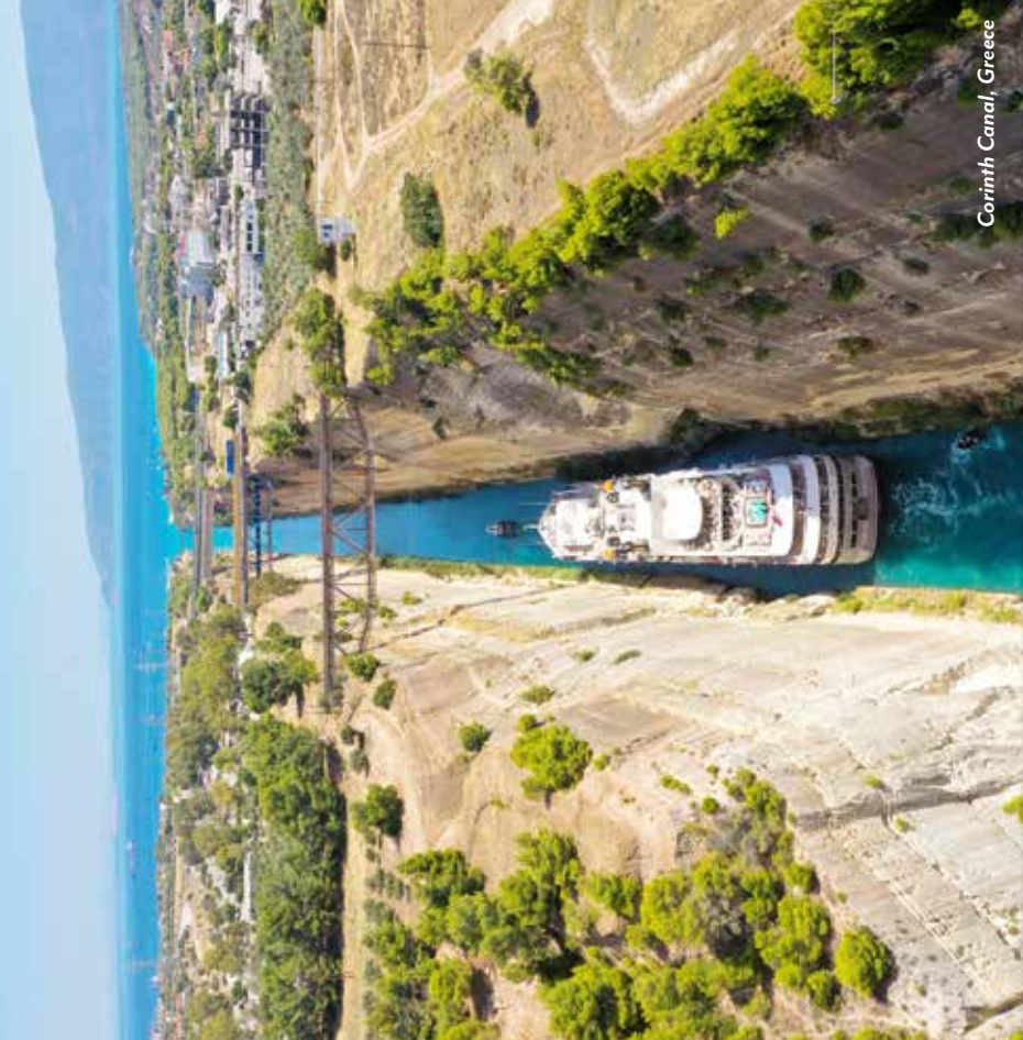
Corinth Canal, Greece

PRSRT STD U.S. Postage PAID Gohagan & Company