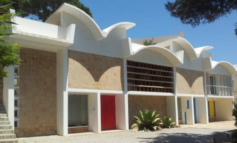
Fundació Pilar i Joan Miró a Mallorca, Palma de Mallorca