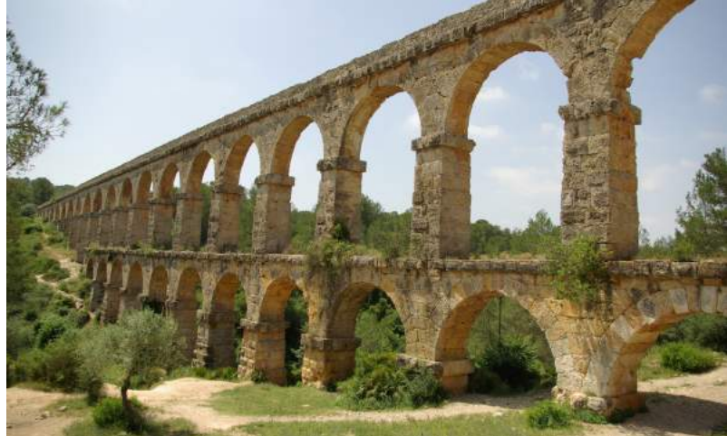
Pont del Diable, Tarragona