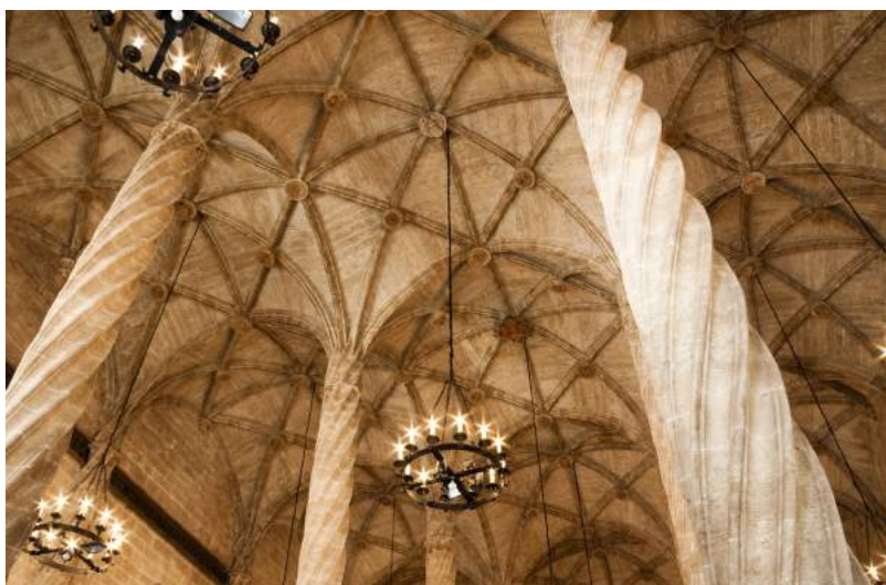
Lonja de la Seda, Valencia

Disembark Sea Cloud II this morning, and transfer to the airport for flights home. B