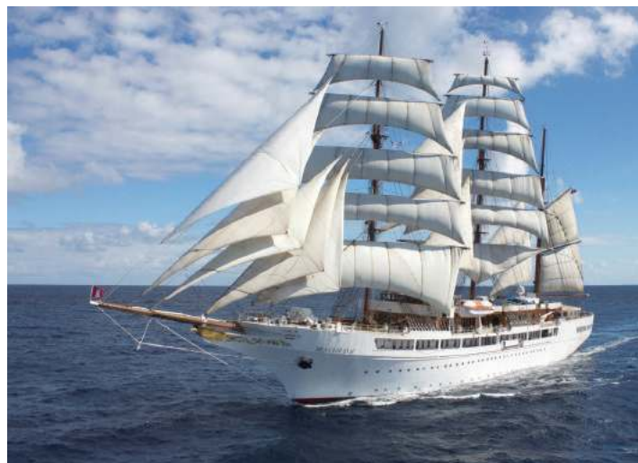
Sea Cloud II

Sea Cloud II is a three-masted sailing yacht steeped in the elegance of yesteryear and complemented with the most modern amenities. Sister ship of the legendary Sea Cloud , Sea Cloud II has 47 outside cabins and travels under 23 billowing sails trimmed by hand. From the mahogany-paneled library and gracious lounge to the gym and watersports platform, no detail has been overlooked. Praised by the world's most discerning travelers, Sea Cloud II receives consistently high rankings from Condé Nast Traveler . Passengers enjoy open seating at all meals and complimentary use of all water sports equipment. A doctor is on call 24 hours a day. Please note: there is no elevator on Sea Cloud II .