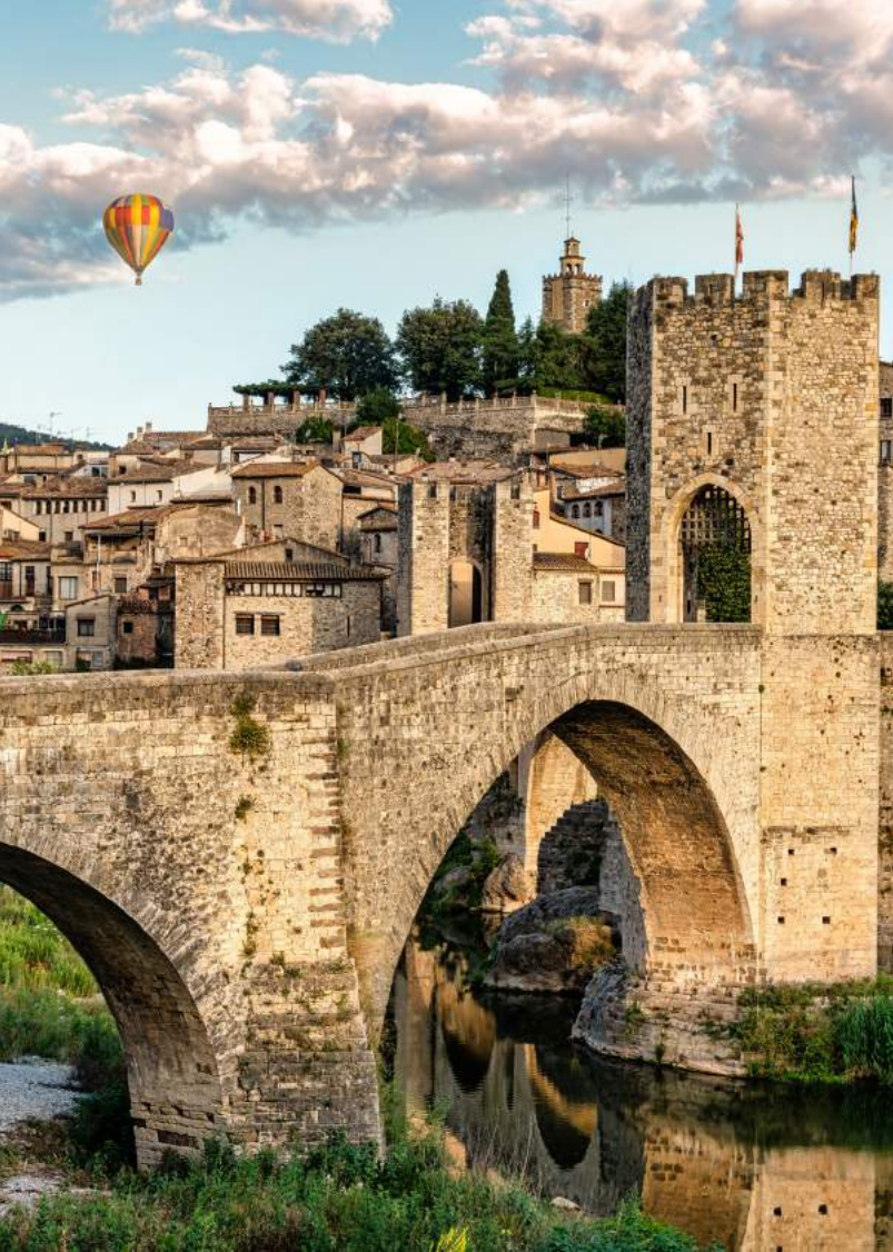
Besalú en Girona, Girona