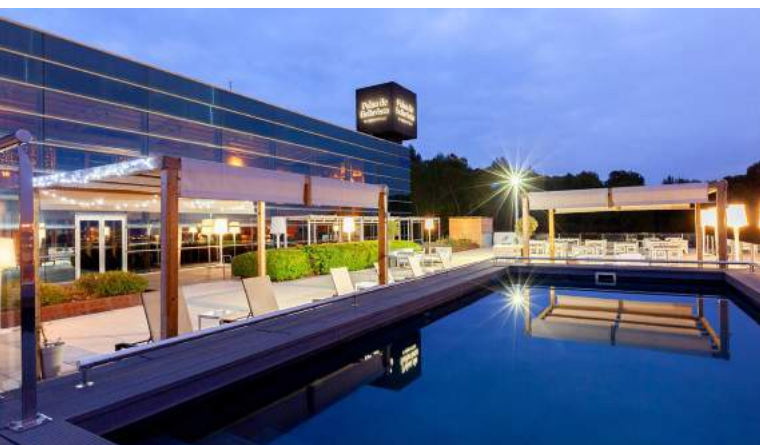
Hotel Palau de Bellavista Girona by URH

This elegant hotel sits in a quiet corner next to Girona's Jewish quarter and Barri Vell (the historic old town). Combining chic design with impeccable service, the Hotel Palau de Bellavista features great views from the hotel's roof terrace as well as a bar and a pool.