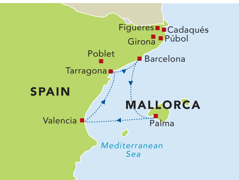
Sea Cloud II Lido Deck (top); Map of the region (above)