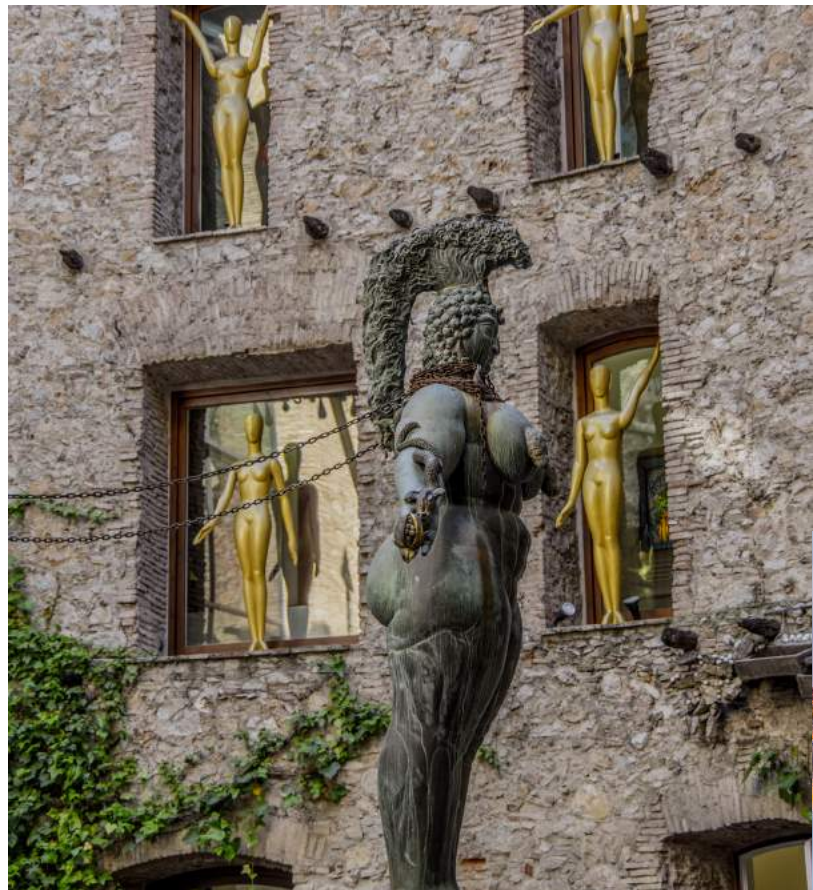
Teatre-Museu Dalí, Figueres

Take a morning tour of the Museu d'Art de Girona, installed in the former Bishop's Palace and a handsome building in its own right. Peruse the museum's particularly rich collection of medieval illuminated manuscripts and paintings. Continue to the Banys Àrabs (Arab Baths) and the Monestir de Sant Pere de Galligants, a Benedictine monastery whose 12th-century buildings form one of Catalonia's most outstanding groupings of Romanesque architecture. After a lunch of Spanish specialties, embark the awaiting Sea Cloud II in Barcelona. B,L,D