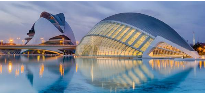
Ciudad de las Artes y las Ciencias, Valencia

Enjoy a day admiring the highlights of Valencia, the “City of Gold.” Discover the Old Town with its UNESCO-recognized Lonja de la Seda (Silk Exchange), a late Gothic masterpiece with its striking cross vaults and marble floors, which has been a commercial center since 1533. You will also visit the Mercado Central (Central Market) and the spectacular 14th- to 15th-century cathedral. Before returning to the ship, visit the Museo de Bellas Artes de Valencia or opt to admire the architecture of the Ciudad de las Artes y las Ciencias, Valencia-born architect Santiago Calatrava’s boldly futuristic City of Arts and Sciences complex. B,L,D