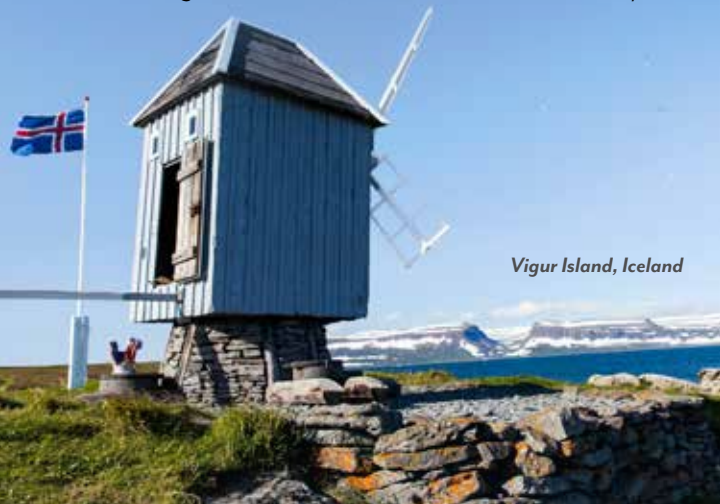
Vigur Island, Iceland

There is an anecdote on Felicity Aston MBE's website that talks about her first "expedition" at the age of nine, which involved "being bribed" up a modest peak in England by her parents. Aston, now one of the most accomplished polar explorers and climate scientists of modern times, says this childhood milestone changed her life. Today, she is both the only woman in the world to have skied across Antarctica alone and the first person in the world to have traversed the continent purely by muscle power, which gave her a place in the Guinness World Records . Her polar career began two decades ago when she traveled to Antarctica as a meteorologist with the British Antarctic Survey. By age 23, she was monitoring climate change at the Rothera Research Station on the Antarctic Peninsula. Her Kaspersky Lab Commonwealth Antarctic Expedition was the first to "Tweet to the Pole" and material from her Pole of Cold expedition has been developed into a traveling art exhibition. Aston has since written five books and produces articles for publications in the U.K. and abroad. She is also owner of Iceland's beautiful Vigur Island, where she lives with her family.