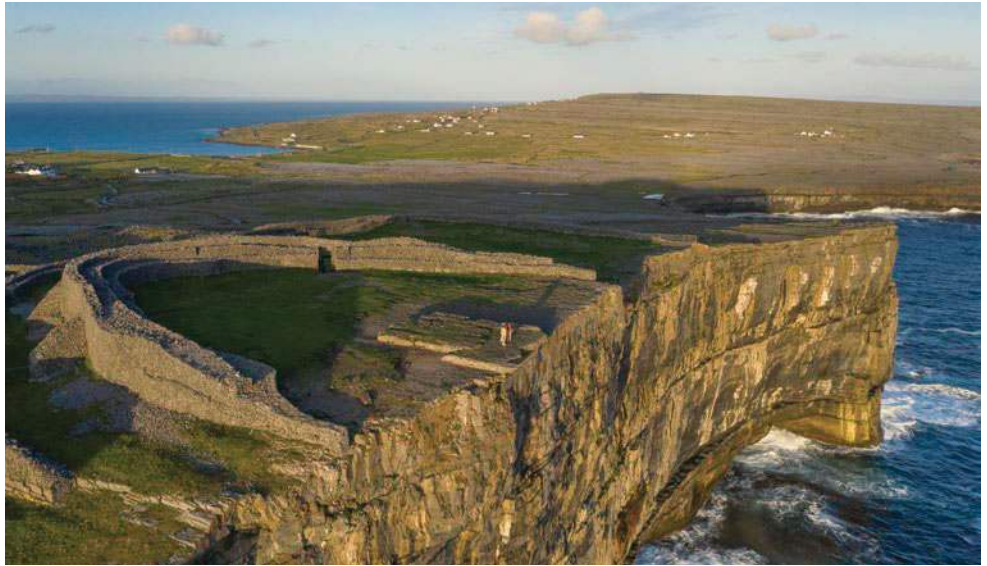
Dun Aengus, Inishmore