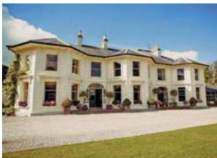
Rathmullan House | Rathmullan