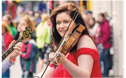
Top: Kylemore Abbey | Above: Musician

Aran Island of Inishmore. Ferry across Galway Bay to the largest of the Aran Islands. As you travel on a minibus, your local guide will share entertaining stories about life on this stark, arresting island, where Gaelic is the first language. See cliffside Dun Aengus, the most famous of the Aran Islands' Bronze Age forts, and pause for lunch before your return ferry.