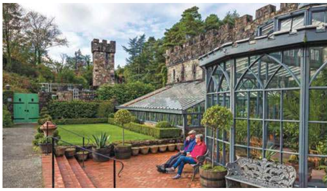
Glenveagh Castle, Glenveagh National Park