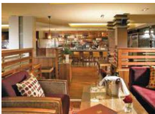
Westport Plaza Hotel | Westport