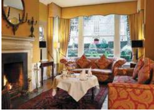
Old Ground Hotel | Ennis