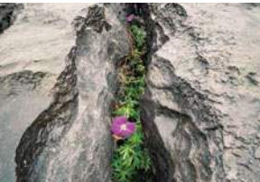
Flora among the limestone, Burren