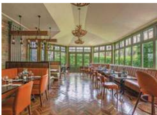
The Lodge at Castle Leslie Estate | Glaslough