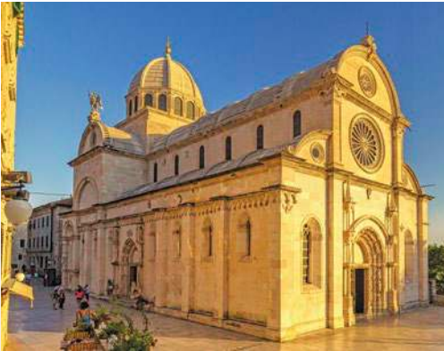
Cathedral of St. James, Šibenik