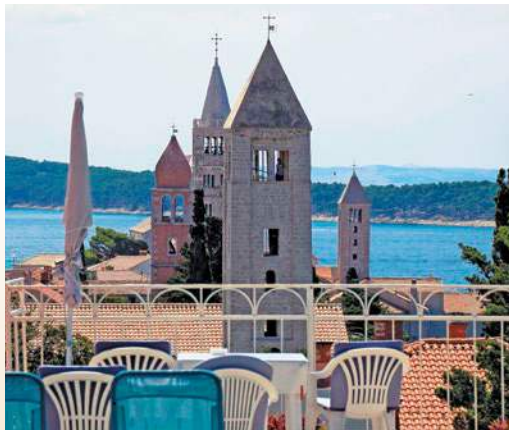
Bell towers of Rab Island