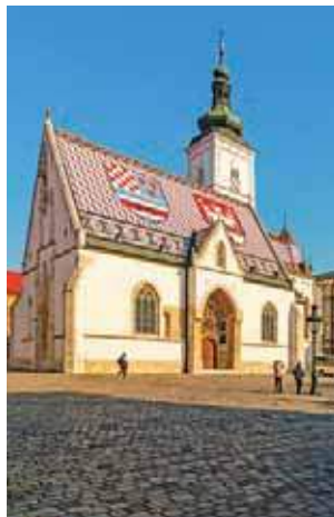
St. Mark's Church, Zagreb

Knowledgeable Lecturers deepen your appreciation for the region and its history, culture and current events.