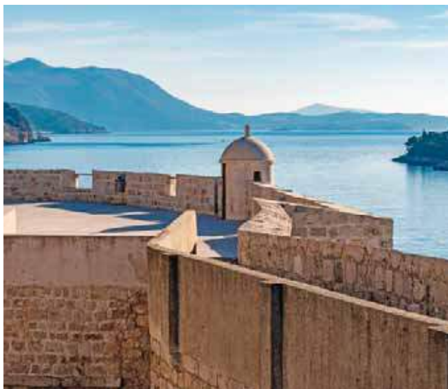
Walls of Dubrovnik