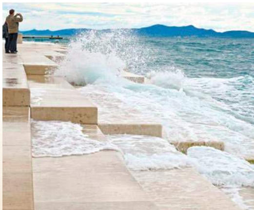
Sea organ, Zadar

After a lunch of regional dishes, continue to Zagreb and check in to the hotel.