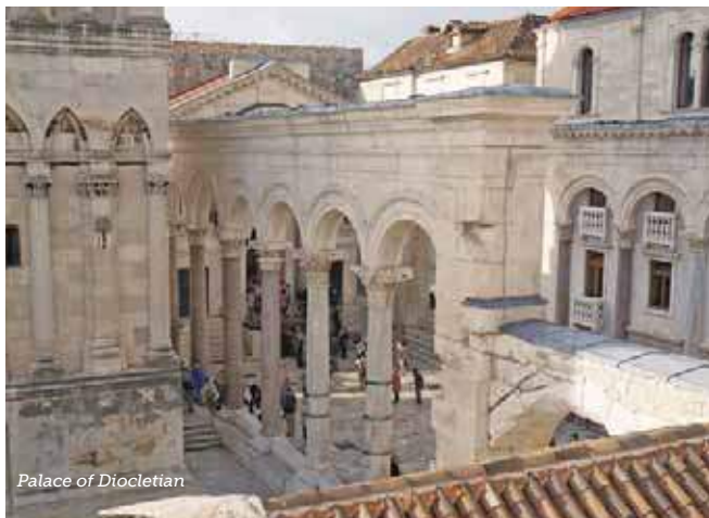
Palace of Diocletian