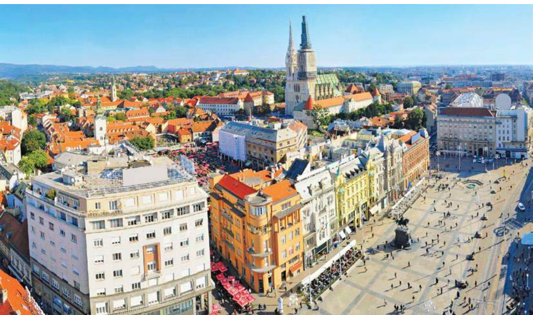
Ban Jelačić Square, Zagreb