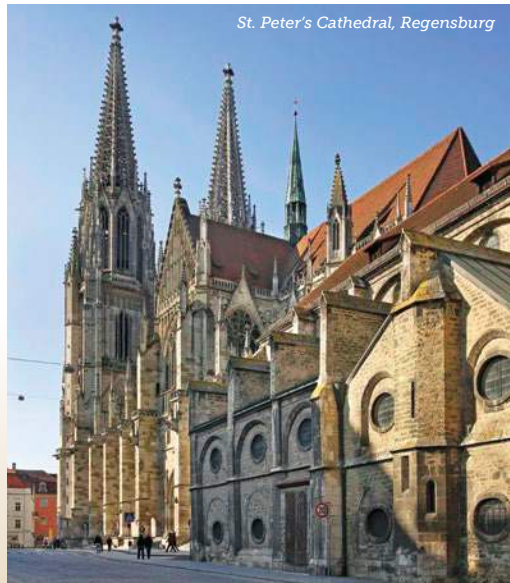
St. Peter's Cathedral, Regensburg