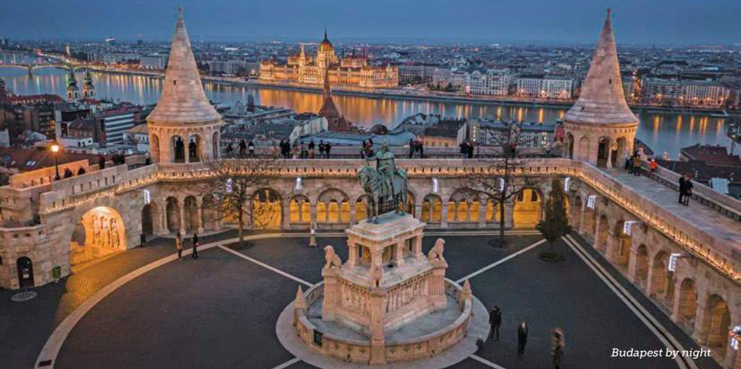
Budapest by night