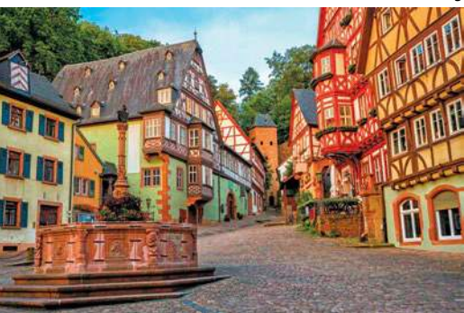
Half-timbered homes, Miltenberg