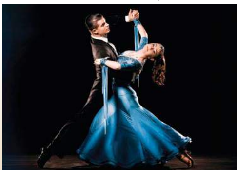
Waltz performance, Vienna