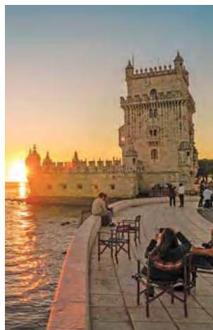
Belém Tower, Lisbon