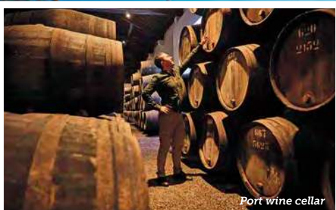
Port wine cellar

Continue to a port wine cellar for a wine tasting. (Active)