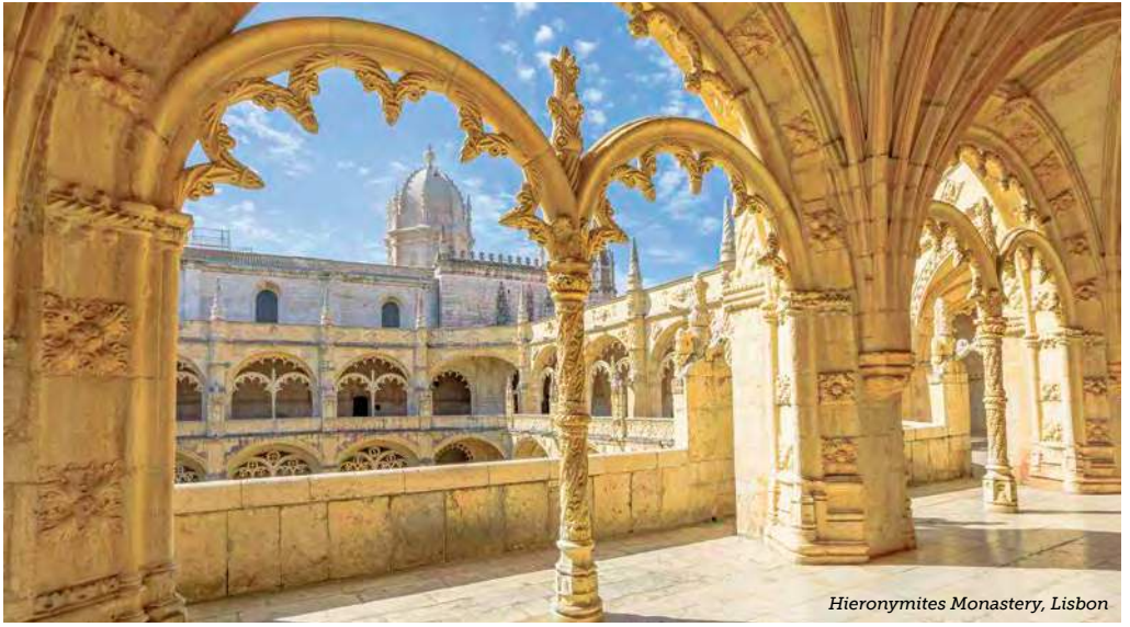
Hieronymites Monastery, Lisbon