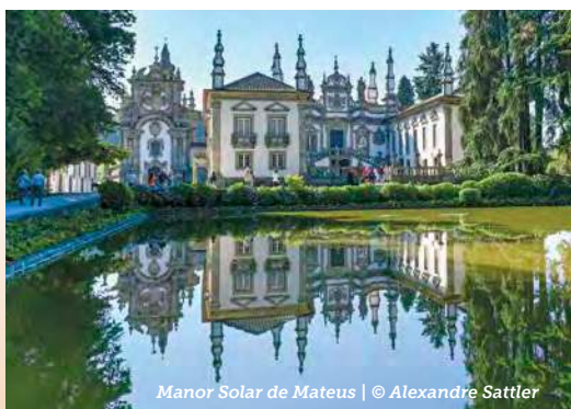
Manor Solar de Mateus