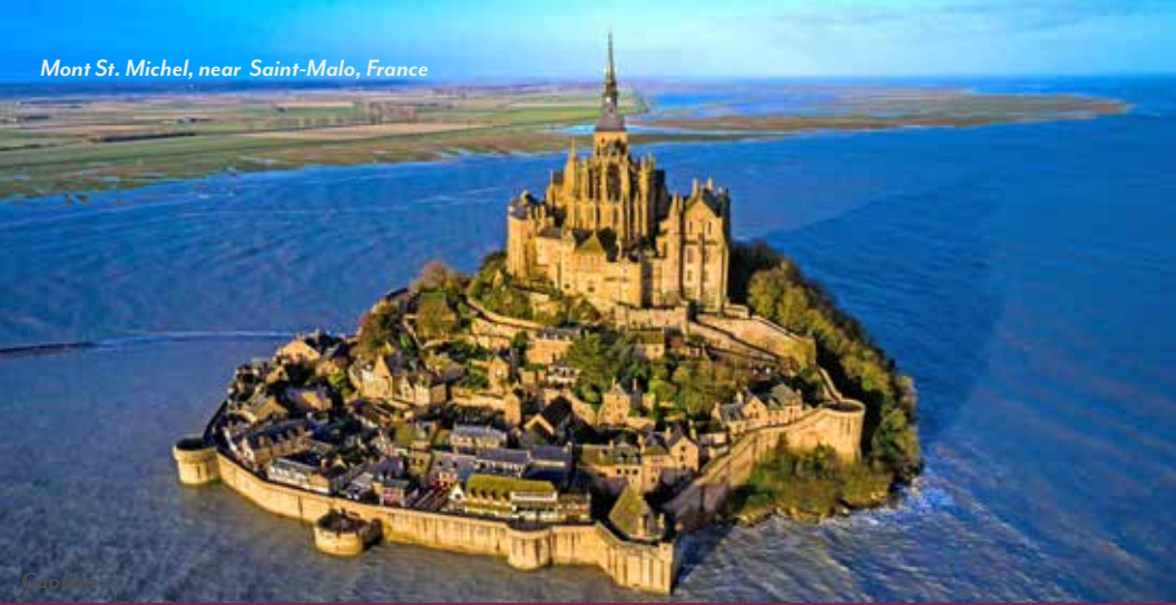
Mont St. Michel, near Saint-Malo, France

above the sea, the UNESCO World Heritage-designated Mont-Saint-Michel is a sight of soaring spires isolated beyond a stretch of saltwater marsh. This fortified village began as a humble oratory and became a renowned medieval center of learning. Cobblestone streets weave through the village, culminating in the Abbaye du Mont-Saint-Michel, a three-story Gothic masterpiece. Admire the serene cloisters, barrel-roofed réfectoire, and Salle des Hôtes of the 13 th -century La Merveille and the magnificent Église Abbatiale. (B,L,D)