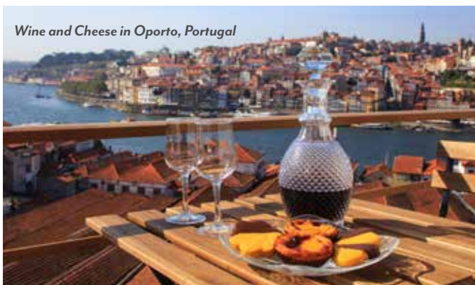
Wine and Cheese in Oporto, Portugal

Visit the UNESCO World Heritage Site of Santiago de Compostela, and stroll along medieval stone streets