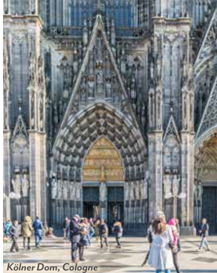
Kölner Dom, Cologne