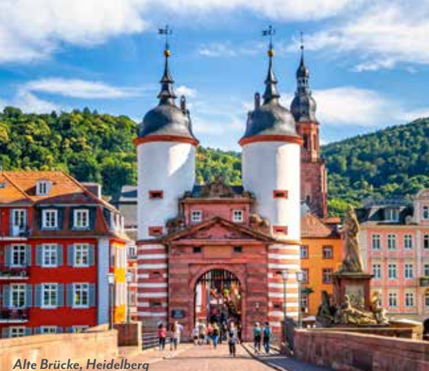
Alte Brücke, Heidelberg