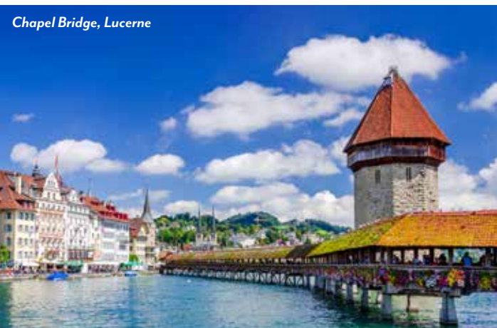
Chapel Bridge, Lucerne

Check out this morning and admire the scenery on the way to Basel, where you will enjoy a guided tour, lunch, and free time. Embark the AMADEUS QUEEN and join the Captain's Welcome Reception and Dinner later tonight. (B,L,R,D)