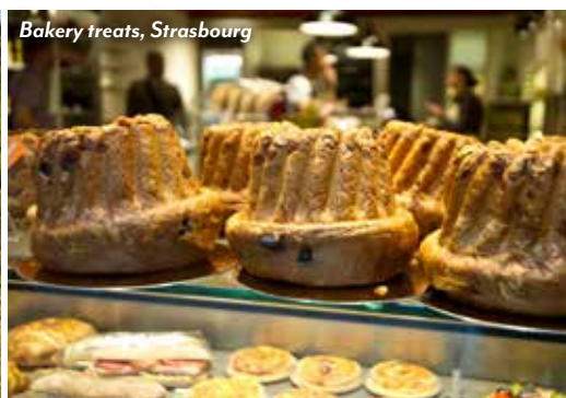
Bakery treats, Strasbourg