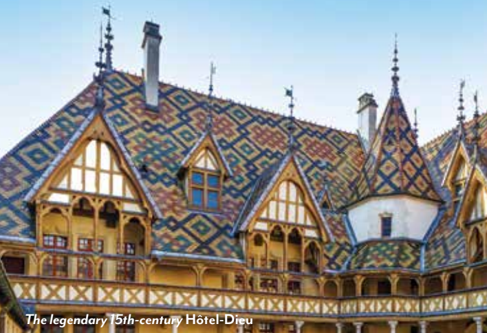
The legendary 15th-century Hôtel-Dieu