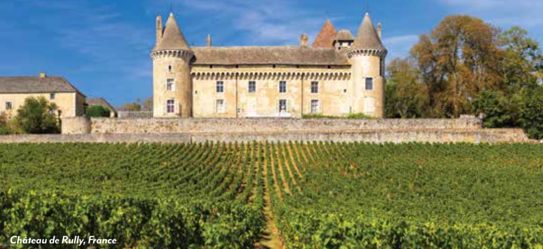
Château de Rully, France

Cathédrale Saint-Maurice d'Angers. Return to the ship for lunch and a special wine and chocolate tasting on board with a local wine expert. Disembark in Tournon to begin your excursion. Choose from walking tour of the picturesque villages of Tournon and Tain l'Hermitage, with a wine tasting; or choose a historical, scenic train ride through the hills around Tournon aboard the Train de l'Ardèche. (B,L,D)