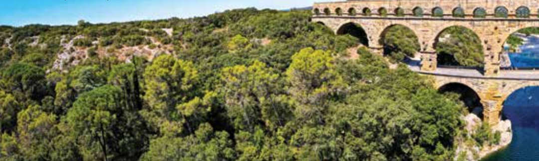
Pont du Gard, Provence, France

Begin your tour of charming Vienne with a short mini-train ride to the top of Mount Pipet. Appreciate the stunning view of the village and river, and then continue on a walking tour of the village. See the ornate, medieval