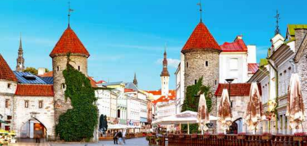
Old Town, Tallinn, Estonia

In his oft-quoted poem, "The Road Not Taken," Robert Frost awakened the idea and determination in many to choose the road less traveled; to overcome fear and avoid regrets. It sparked the quest for adventure in those wishing to experience more from life. Intrepid world travelers manifest this idea by seeking out destinations less traveled, such as Scandinavia and the Baltic Sea, which is surrounded by nine countries in Northern Europe. Here, travelers have the rare opportunity to visit a number of countries and experience a kaleidoscope of cultures in a short period of time when cruising by ship from port to port. Ancient architecture, centuries-old history, storied landmarks, fascinating cities, and breathtaking, romantic scenery provide the perfect backdrop and opportunity to take the road less traveled, which will surely make all the difference.