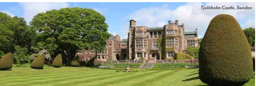
Tjolöholm Castle, Sweden

Latvia's little-known capital is brimming with 18th- and