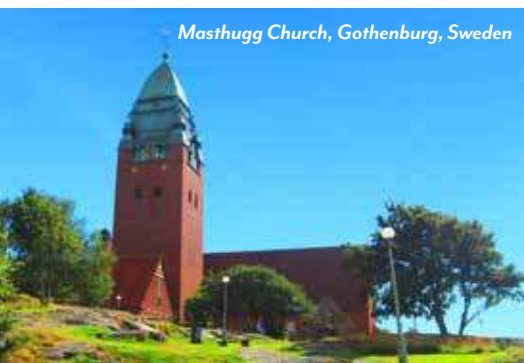
Masthugg Church, Gothenburg, Sweden

*The July 31 departure operates in reverse