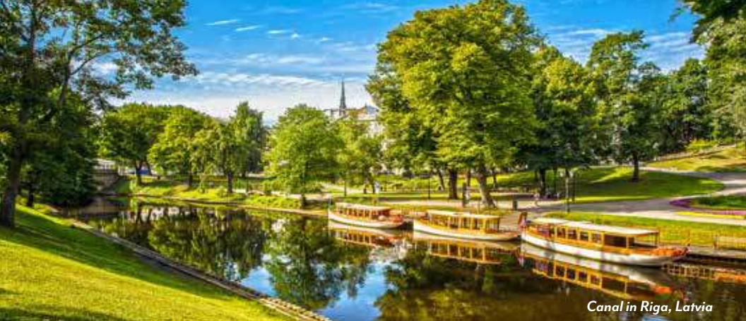
Canal in Riga, Latvia