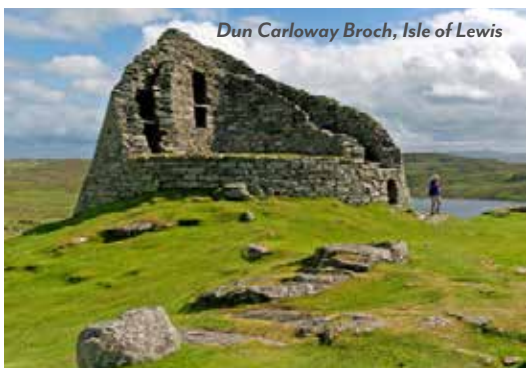
Dun Carloway Broch, Isle of Lewis