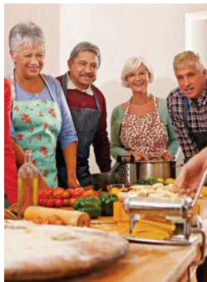
Piedmontese cooking class