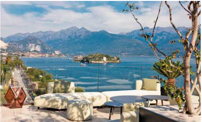
Hotel la Palma | Stresa