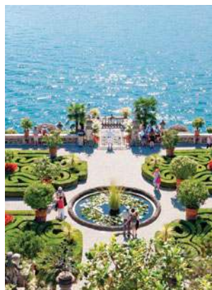
Isola Bella, Lake Maggiore