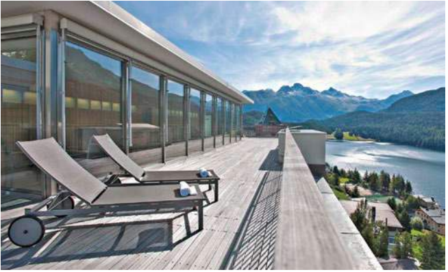
Hotel Schweizerhof | St. Moritz