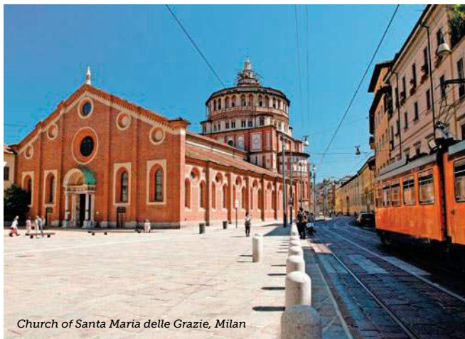
Church of Santa Maria delle Grazie, Milan