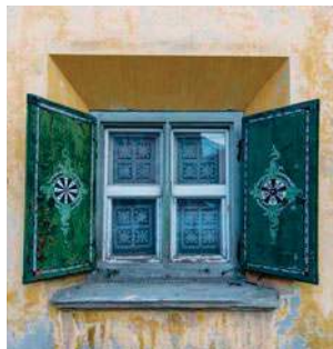
Charming Engadine architecture