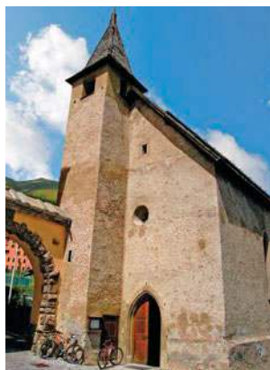
Old church, Zuoz