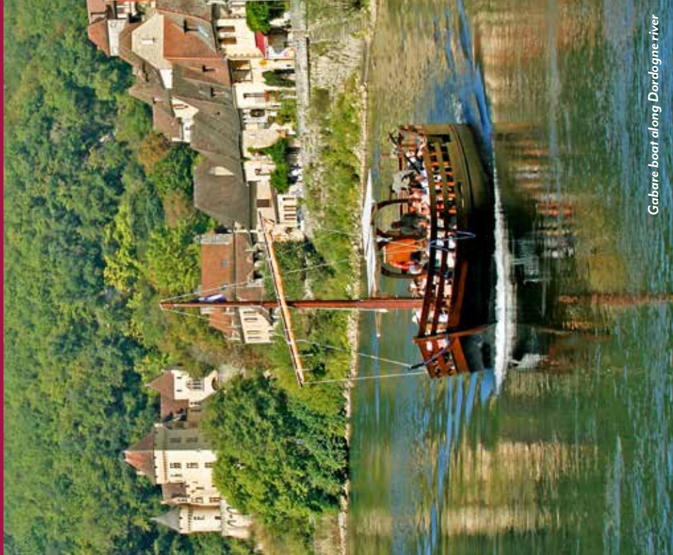
Gabare boat along Dordogne river

PRSRT STD U.S. Postage PAID Gohagan & Company