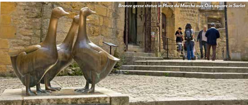
Bronze geese statue in Place du Marché aux Oies square in Sarlat

Enjoy an early breakfast buffet at the hotel before your overnight return flight to your home city. (B)