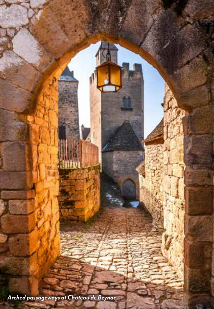
Arched passageways at Château de Beynac