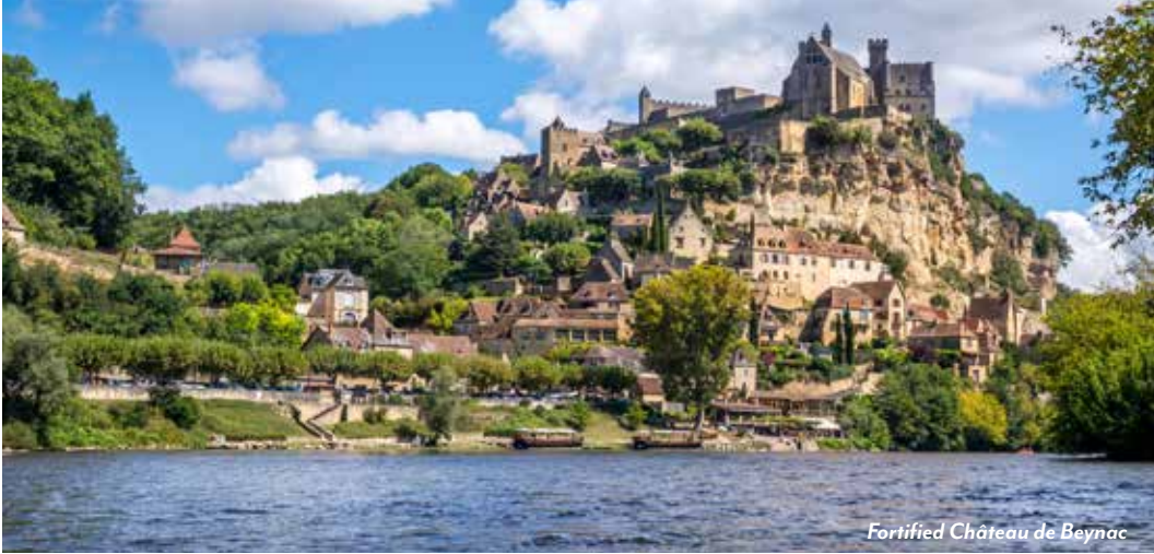
Fortified Château de Beynac