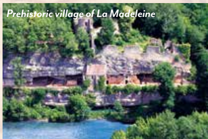
Prehistoric village of La Madeleine

Near the village of Les Eyzies, visit the original Cro-Magnon rock shelter and UNESCO World Heritage Site of L'Abri de Cap-Blanc, showcasing the rare, life-size frieze of horses and bison sculpted in limestone. An expert-guided tour of the National Museum of Prehistory in Les Eyzies helps put this vast network of prehistoric art into context. La Madeleine also features magnificent caves inhabited by families over many millennia.