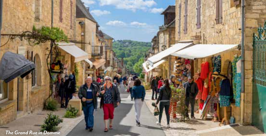
The Grand Rue in Domme

civilization, along with one-of-a-kind life-size cave paintings. (B,L)