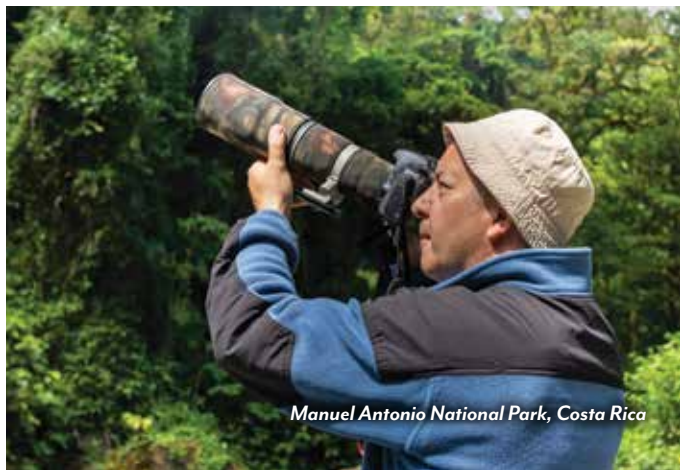
Manuel Antonio National Park, Costa Rica