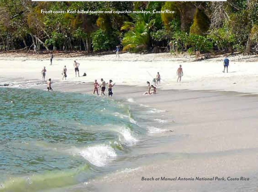
Beach at Manuel Antonio National Park, Costa Rica

Front cover: Keel-billed toucan and capuchin monkeys, Costa Rica