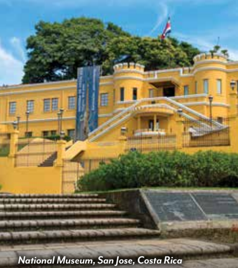
National Museum, San Jose, Costa Rica