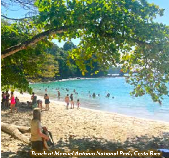
Beach at Manuel Antonio National Park, Costa Rica

Explore the island on a guided beach walk or a snorkeling adventure. (B,L,D)