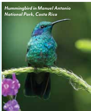
Hummingbird in Manuel Antonio National Park, Costa Rica