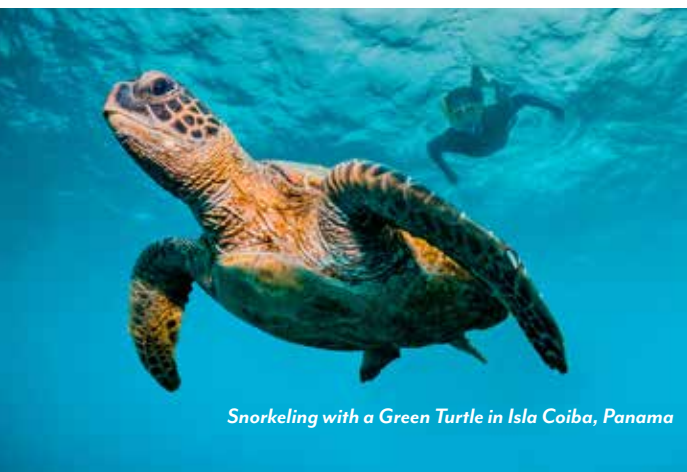
Snorkeling with a Green Turtle in Isla Coiba, Panama

This island is part of Coiba National Park, a UNESCO World Heritage site. An astounding range of wildlife calls this area home, including agoutis, howler monkeys, giant toads and green iguanas. The clear turquoise waters support bottlenose dolphins, giant seahorses and numerous species of shark and whale.