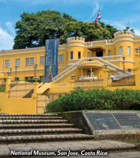
National Museum, San Jose, Costa Rica