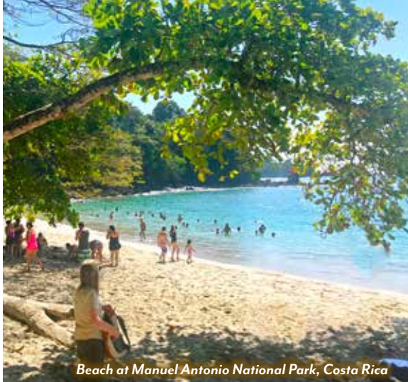
Beach at Manuel Antonio National Park, Costa Rica

Explore the island on a guided beach walk or a snorkeling adventure. (B,L,D)