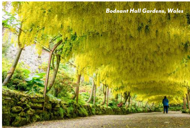
Bodnant Hall Gardens, Wales