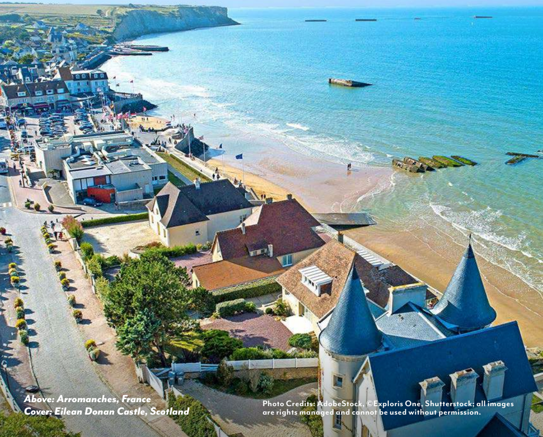
Above: Arromanches, France Cover: Eilean Donan Castle, Scotland