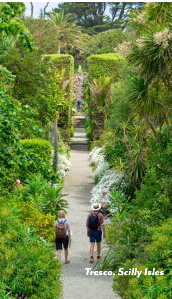
Tresco, Scilly Isles

Tresco, Scilly Isles, England Join David Eisenhower for an insightful lecture this morning. Set off to discover the lovely Tresco Abbey Gardens. Though it is just 28 miles off the Cornwall coast, its unique climate makes it the ideal location for tropical and subtropical plants, such as