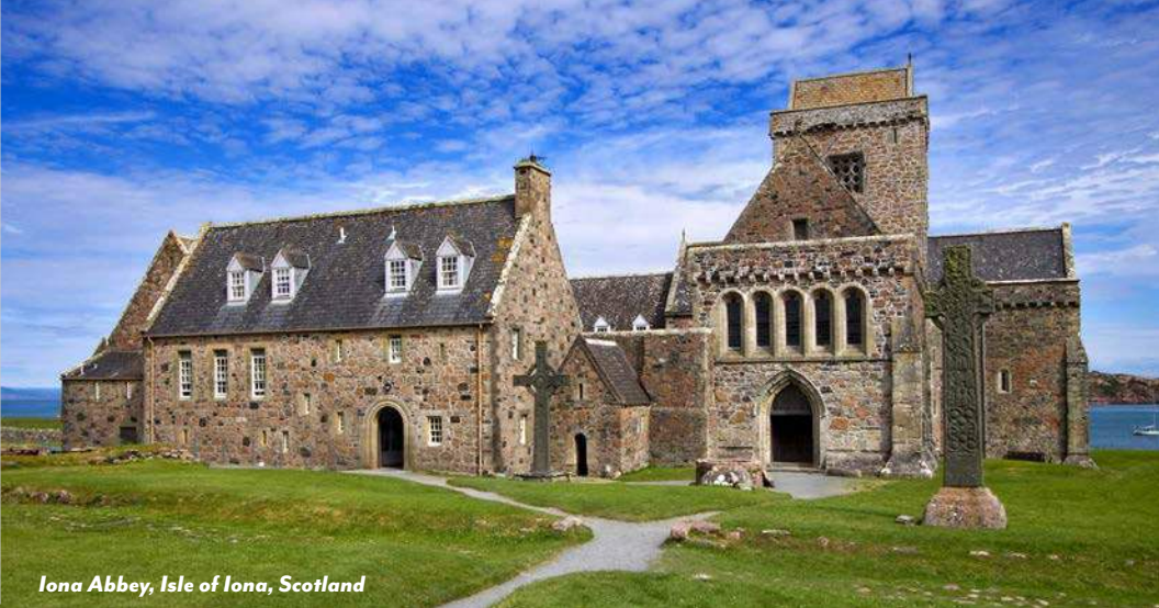
Iona Abbey, Isle of Iona, Scotland