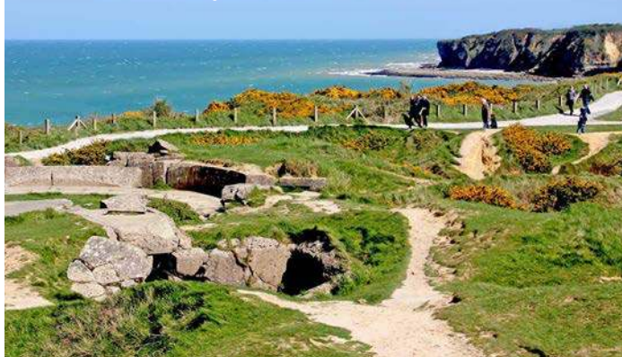
Pointe du Hoc, Normandy, France

the Utah Beach Landing Museum for a comprehensive look at the D-Day battle from planning to its execution. Continue to Catz to visit the Church of Angoville au Plain, where two U.S. Army medics used to treat both American and German injured soldiers. Relax over lunch at a local restaurant near the Normandy Victory Museum; then drive to Sainte-Mère-Église, said to be the first town liberated by Allied troops on D-Day. Learn about the events of that day and see key landmarks. Our next stop is Azeville. The Azeville Battery was a World War II German artillery position located near the