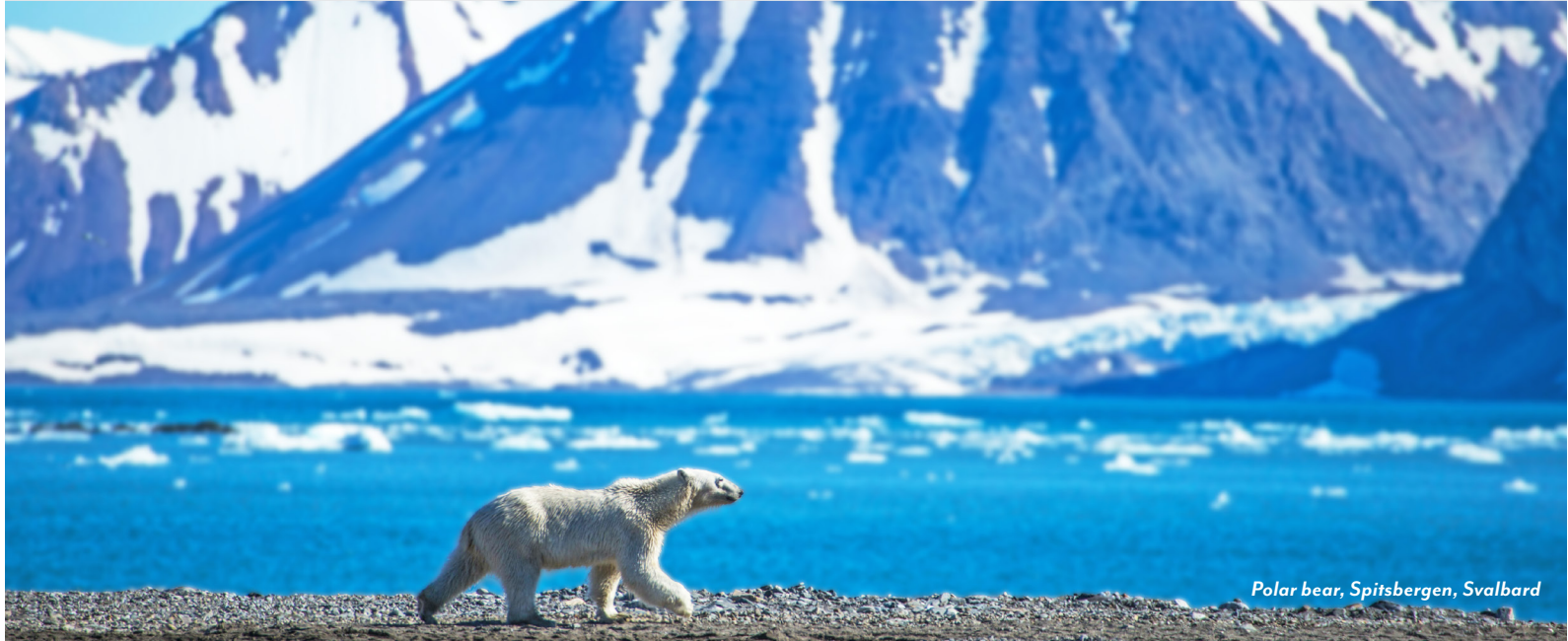
Polar bear, Spitsbergen, Svalbard