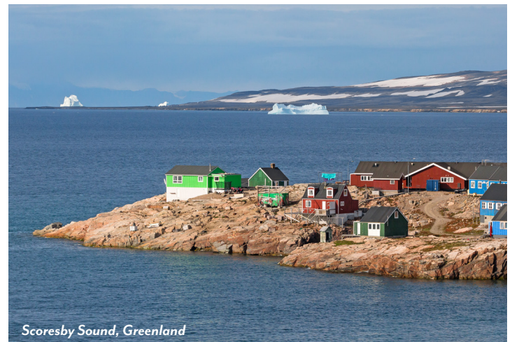
Scoresby Sound, Greenland