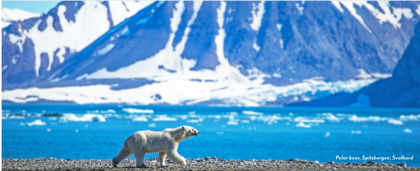
Polar bear, Spitsbergen, Svalbard