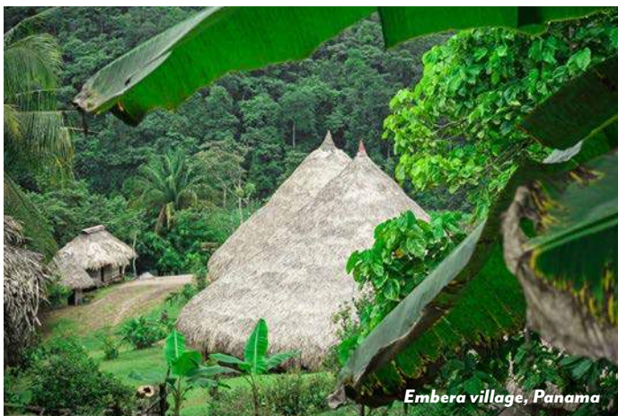
Embera village, Panama