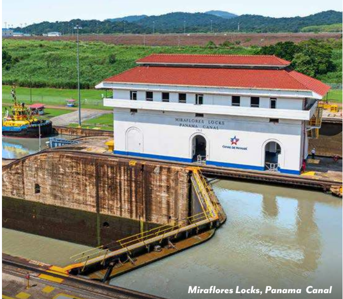
Miraflores Locks, Panama Canal

of rainforest, beach and coral reef. See hundreds of mammal and bird species that call this park home, along with countless amphibians and reptiles. Naturalist guides will lead an exploration of this protected paradise, where you may spot vibrant toucans, camouflaged iguanas, howler monkeys, tree-dwelling squirrel monkeys, sloths and Capuchin monkeys.