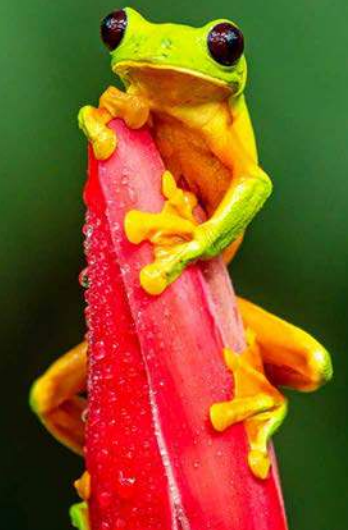
Gliding tree frog, Costa Rica