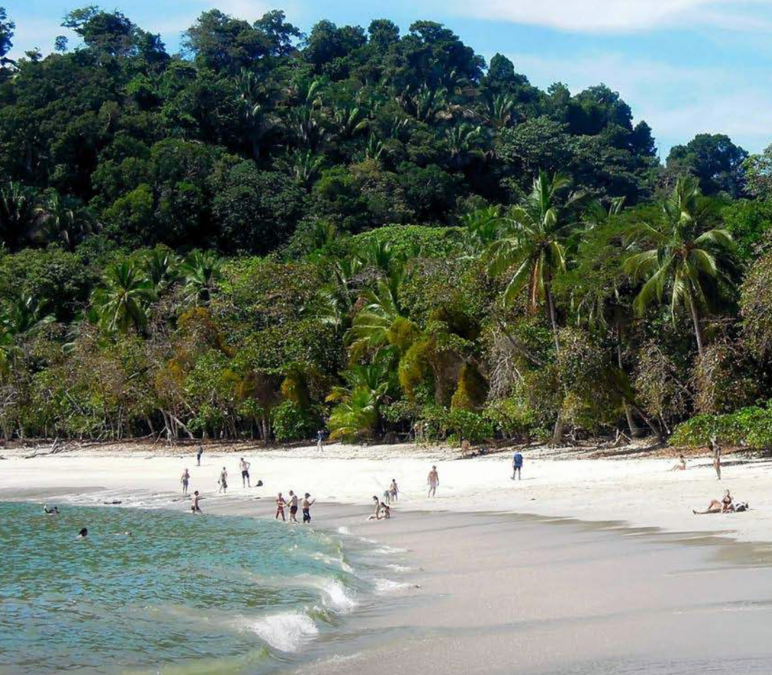
Above: Manuel Antonio National Park, Costa Rica Cover: Keel Billed Toucan; Panama Canal Locks