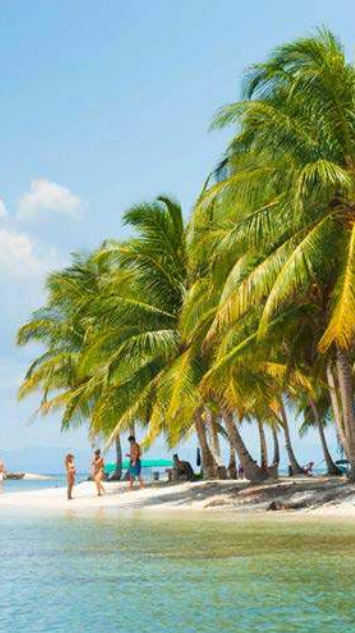
San Blas Islands, Panama

lowering the ship 85 feet in this unique and memorable experience. Enjoy a delicious lunch and time to relax onboard the ship.