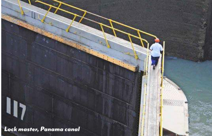
Lock master, Panama canal