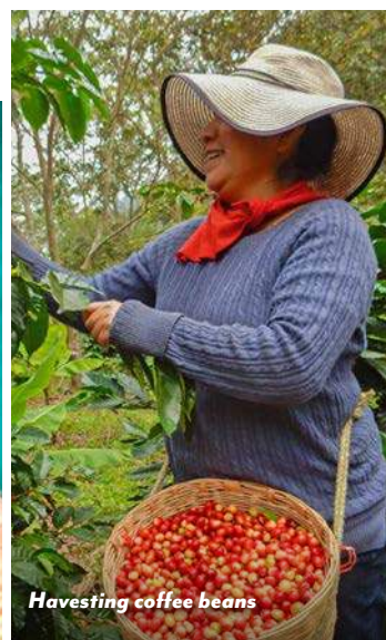
Harvesting coffee beans