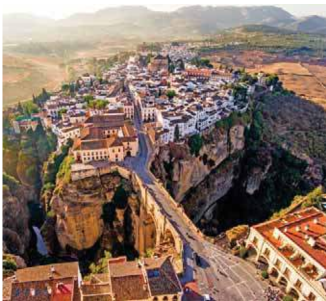
El Tajo Gorge, Ronda