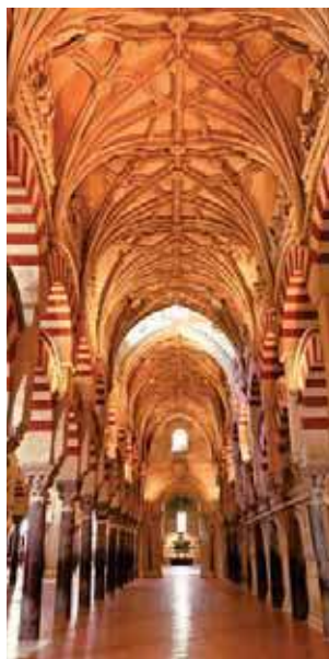
La Mezquita, Córdoba

Knowledgeable Lecturers deepen your appreciation for the region and its history, culture and current events.