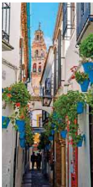
Jewish Quarter, Córdoba