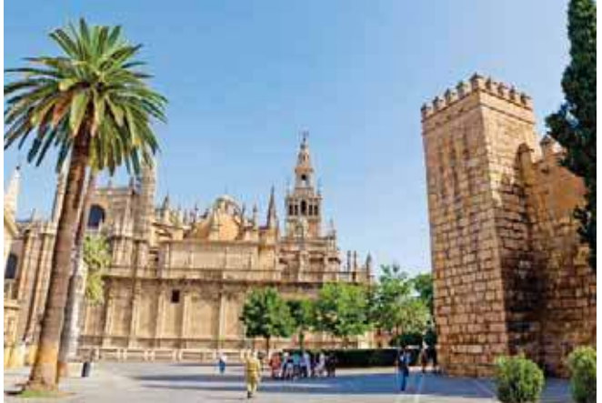
Cathedral and Alcázar, Sevilla