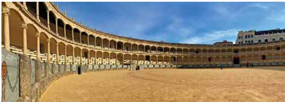
Plaza de Toros, Ronda