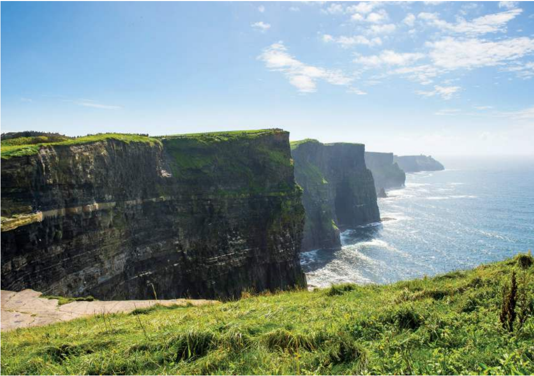
The sun shines down on the Cliffs of Moher, as we see on Day 7.

here, imparting local lore along the way. We stop at Dun Aenghus Fortress, the three prehistoric stone walls crowning the tallest cliffs of Inishmore; have lunch in a local pub; and enjoy some free time before returning to the mainland and our hotel late this afternoon. Dinner tonight is at a local restaurant in the village of Bearna. B,L,D