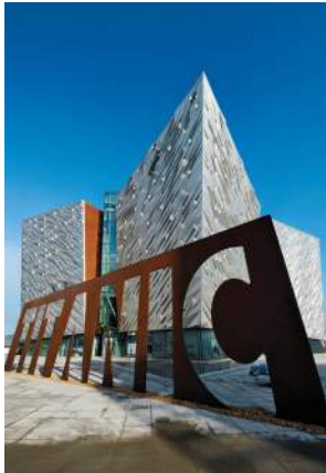
Titanic Museum, optional extension

most beautiful, then embark on an informal walking tour of Kilkenny itself, noting the many buildings of “black” or Kilkenny marble, quarried locally. After lunch together at a local pub, the remainder of the day is at leisure. B,L