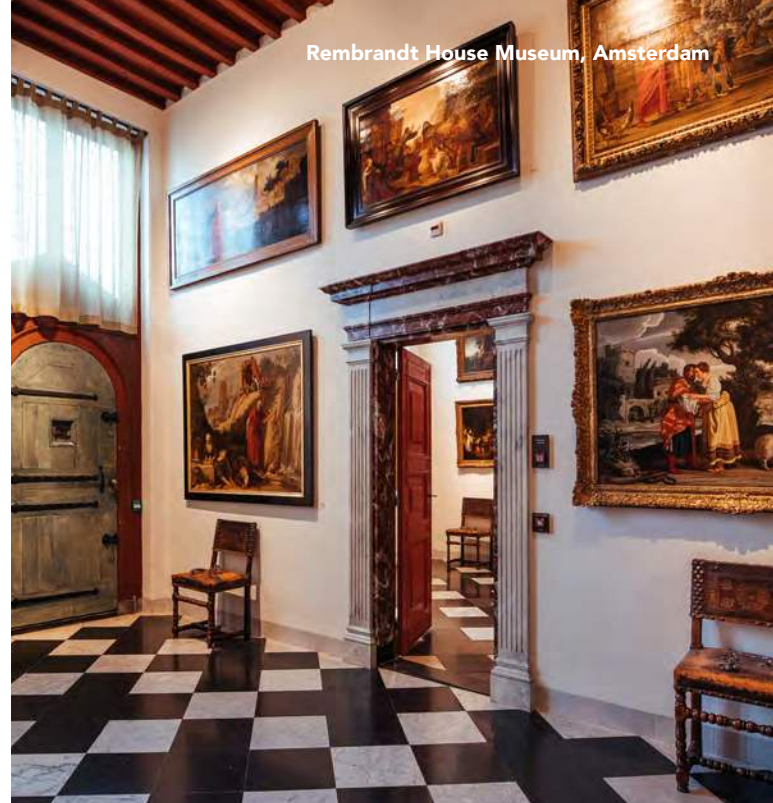
Rembrandt House Museum, Amsterdam

INCLUDES: One night accommodations at the Radisson Blu Hotel, Amsterdam City Center, with one reception and one breakfast. Sightseeing as noted.