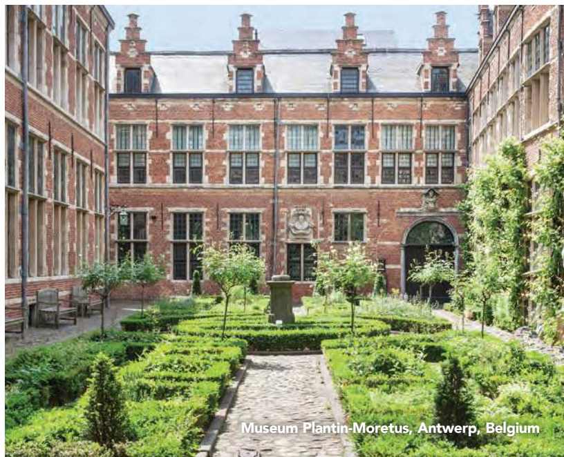
Museum Plantin-Moretus, Antwerp, Belgium

In the morning, cruise or bike to Ghent, one of Europe's best-kept secrets. After lunch, enjoy a tour through the city's medieval center, including the magnificent St. Bavo's Cathedral, in use for more than 1,000 years. View its greatest treasure, the restored 15th-century Adoration of the Mystic Lamb (Ghent Altarpiece) by the Van Eyck brothers, known as "history's most stolen artwork," now returned to its rightful home. B,L,D