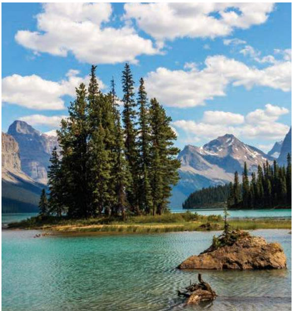
Stunning Maligne Lake and Spirit Island, Jasper National Park

a wide waterfall just outside Banff. The afternoon is free to explore Banff before we celebrate our outdoor adventures with a farewell dinner at our hotel. B,D