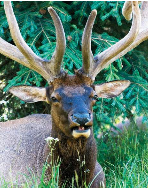
Elk abound in the Rockies.

Day 6: Whitefish/Lake Louise – Banff National Park Today’s full day of travel presents some of the most striking scenery of our tour. We begin the day passing through forests, by lakes, and across high plains before crossing from the U.S. back into Canada – this time, into British Columbia. After a stop for lunch and a drive along the western edge of the Canadian Rockies, we enter world-famous Banff National Park