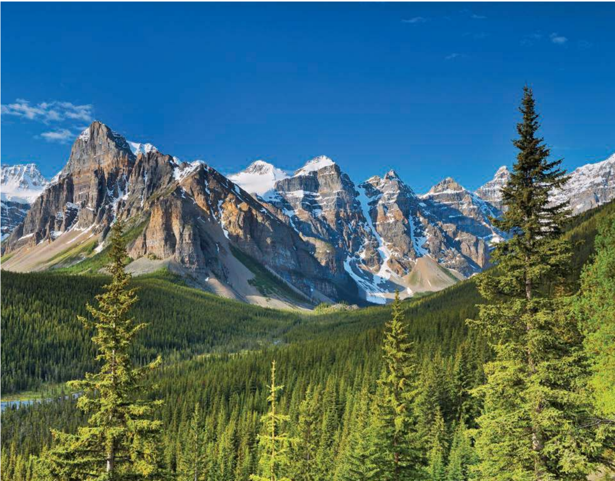
We spend several days absorbing the natural beauty of the Canadian Rockies’ jagged peaks, pristine rivers, and primeval forests.

Day 1: Depart the U.S. for Calgary, Canada We depart the United States today for our flight to Calgary. Upon arrival, we check in to our centrally located hotel then have time to explore this cosmopolitan Canadian city on our own. Tonight we gather for a briefing on the journey ahead followed by dinner at our hotel. D