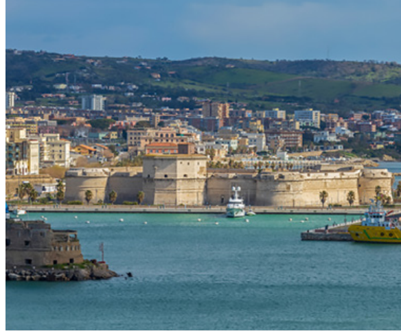
Harbor of Civitavecchia

century B.C. Greco-Roman amphitheater of Taormina followed by free time in town; 3) A journey through the Sicilian countryside for a hike in Alcantara Gorge, an impressive canyon formed by the Alcantara River and lava flows from Mt. Etna. EMERALD SAKARA (B,L,D)