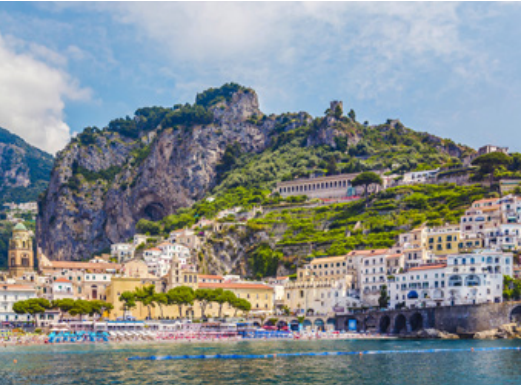
Sorrento, Amalfi Coast