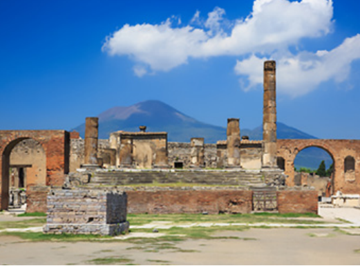
Pompeii and Mount Vesuvius