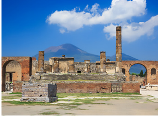
Pompeii and Mount Vesuvius