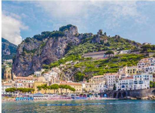
Sorrento, Amalfi Coast