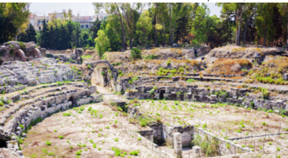
Roman Amphitheater, Siracusa

Disembark this morning and transfer to the airport for flights home or begin the optional post-tour extension in Rome. (B)