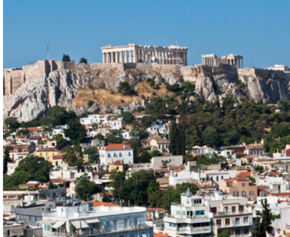
The ancient Plaka below the Acropolis in Athens