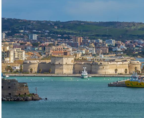
Harbor of Civitavecchia

century B.C. Greco-Roman amphitheater of Taormina followed by free time in town; 3) A journey through the Sicilian countryside for a hike in Alcantara Gorge, an impressive canyon formed by the Alcantara River and lava flows from Mt. Etna. EMERALD SAKARA (B,L,D)