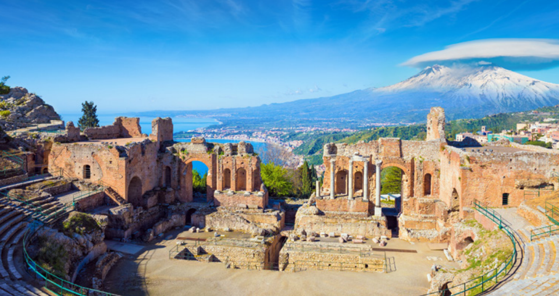
Amphitheater of Taormina