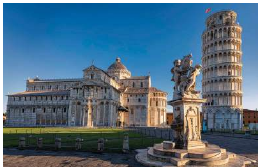
Campo dei Miracoli, Pisa, Italy.

The Leaning Tower has long been Pisa's best-known attraction. But the Campo dei Miracoli (Field of Miracles), Duomo, Baptistery, and Camposanto complete an unrivaled quartet of medieval masterpieces. These—along with a dozen churches and palazzos scattered about the town—belong to Pisa's "Golden Age," from the 11th century to the 13th century. After your time in Pisa, head to Pietrasanta, world famous for its exquisite marble. Michelangelo was the first sculptor to recognize its beauty. Today sculpture studios mingle with small, elegant shops among the wooden shutters and ochre-washed buildings in the deep alleyways that radiate from Piazza del Duomo. (B,L,D)