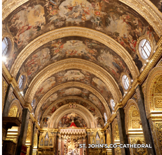
ST. JOHN'S CO-CATHEDRAL