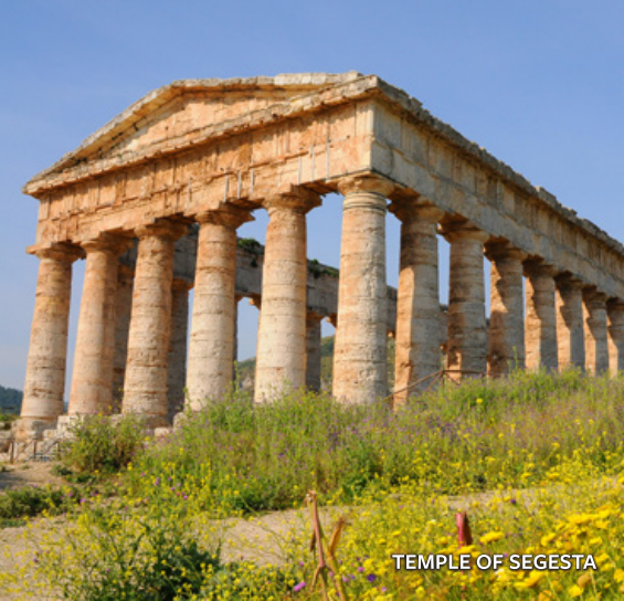
TEMPLE OF SEGESTA