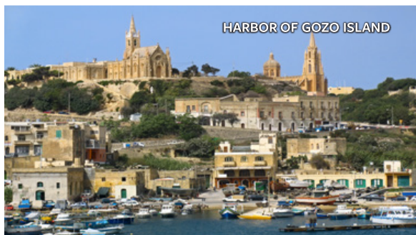
HARBOR OF GOZO ISLAND