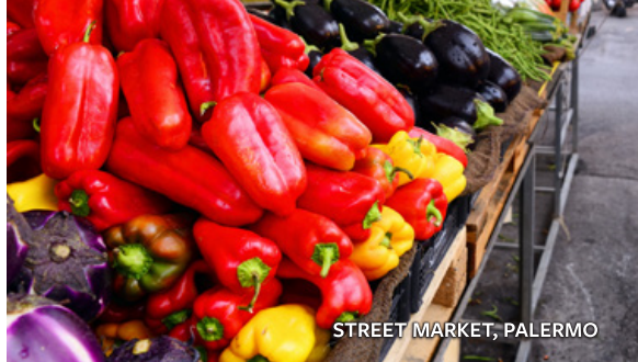
STREET MARKET, PALERMO