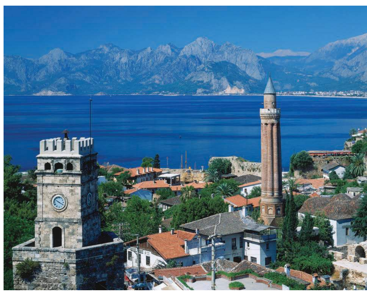
An Antalya landmark, the Yivli Minare (fluted minaret) overlooks the Turquoise Coast.

Ratings are based on the Hotel & Travel Index, the travel industry standard reference. Unrated hotels may be too small, too new, or too remote to be listed.