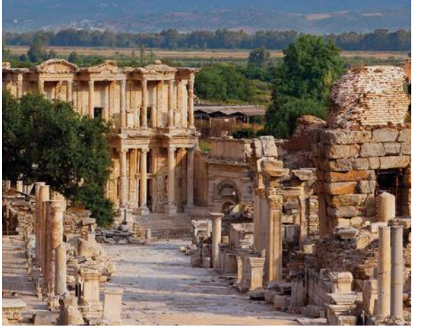
Ruins at Ephesus

Day 14: Antalya/Perge This morning we explore the ruins at Perge, an ancient Greek city once among the world's prettiest and most prosperous. We also visit the Düden Waterfalls, which tumble about 130 feet into the Mediterranean. Returning to our hotel, this afternoon is at leisure. Tonight, we celebrate our Turkish adventure over a farewell dinner together. B , D