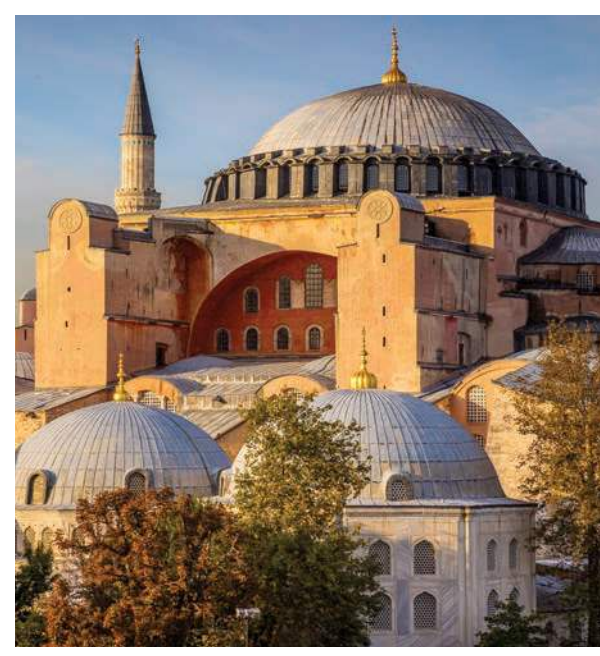
Istanbul's Hagia Sophia

Day 9: Kusadasi/Ephesus We return to Ephesus to visit the Basilica of St. John, the 6<sup>th</sup>-century ruins