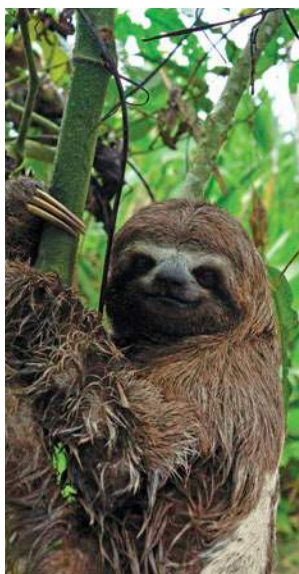
Sloth, Amazon Basin