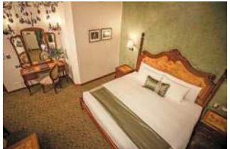
Aranwa Cusco Boutique Hotel | Cusco