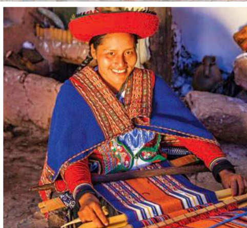
Above: Plaza de Armas, Cusco | Inset: Local woman weaving

Take in scenic views on a train ride through the Sacred Valley to the town of Aguas Calientes and the Inkaterra Machu Picchu Pueblo hotel.