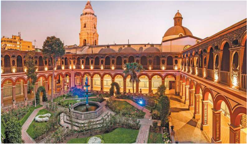
Monastery of Santo Domingo, Lima