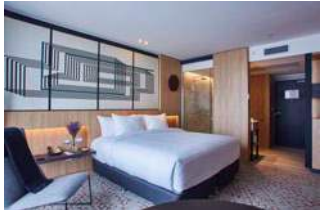
Pullman Lima Miraflores | Lima