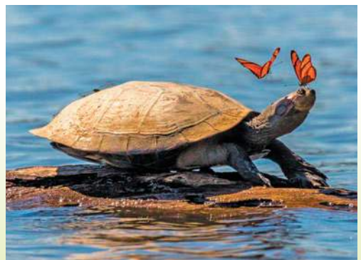
Amazon side-necked turtle