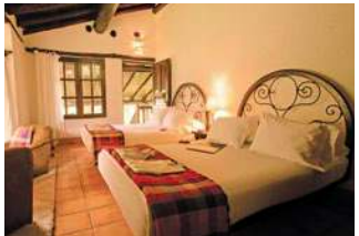
Inkaterra Machu Picchu Pueblo | Machu Picchu