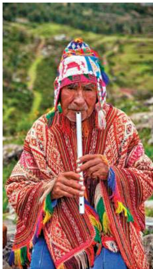
Traditional Peruvian music

Knowledgeable Lecturers deepen your appreciation for the region and its history, culture and current events.