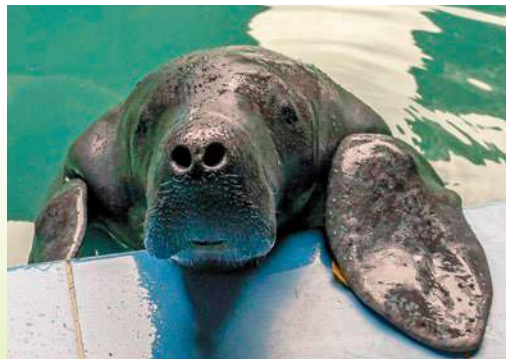
Manatee Rescue Center