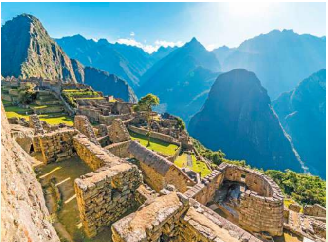
Exploring Machu Picchu