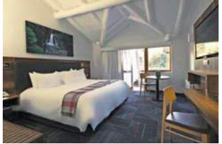
Casa Andina Premium Valle Sagrado | Sacred Valley