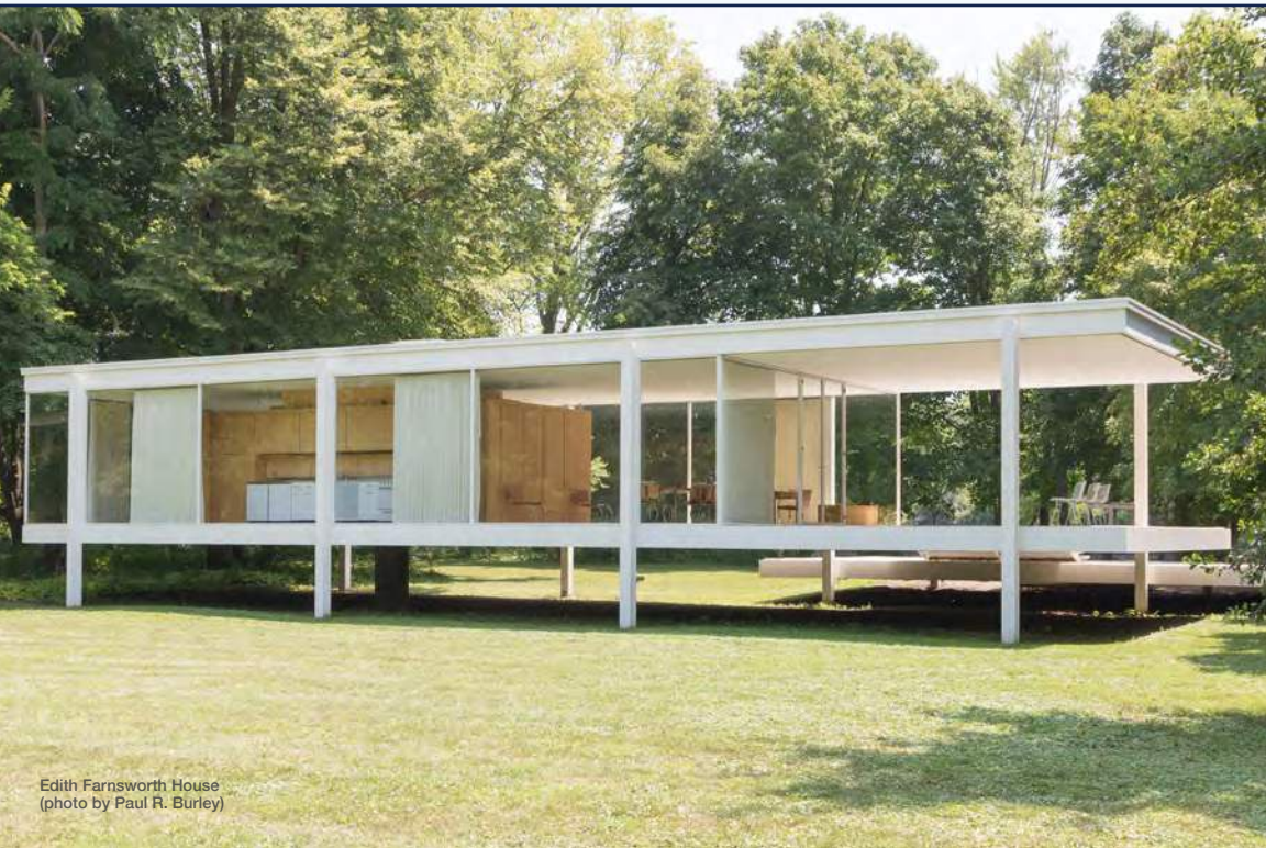
Edith Farnsworth House

Spend the morning on a walking tour of the historically significant architectural gems surrounding the hotel, including the Rookery, the Marquette Building, the Monadnock Building, and the Chicago Federal Center. Return to the hotel for check-out before 11:00am and transfer to the hotel independently for return flights home. (Breakfast)