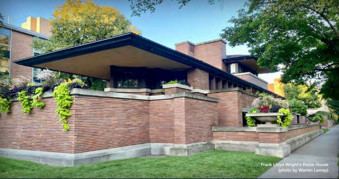
Frank Lloyd Wright's Robie House