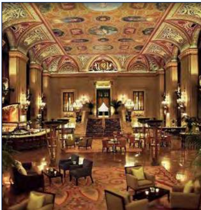
Lobby at the Palmer House Hilton