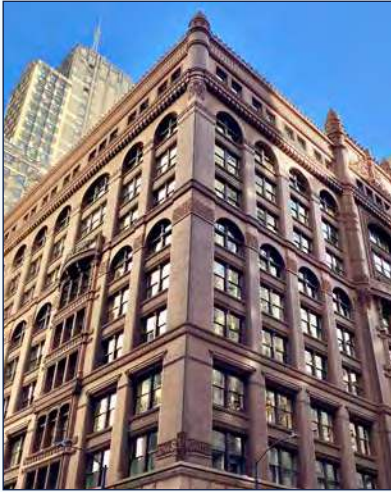
Rookery Building

National Trust Tours returns to Chicago—a quintessential destination for architecture lovers—brought to you as only the National Trust can. Take an architectural cruise along the Chicago River, highlighting the many innovative and historically important architectural designs that were born in Chicago. See several Frank Lloyd Wright-designed buildings, including his own home and studio in Oak Park, Unity Temple, and the iconic Robie House. Enter Ludwig Mies van der Rohe’s Edith Farnsworth House, a masterpiece of design and elegant Modernist simplicity. Enjoy one of the finest private collections of decorative arts from the American and English Arts and Crafts Movements, showcased in the renovated farm buildings of a private estate. And take guided explorations of some of Chicago’s most intriguing and dazzling sites.