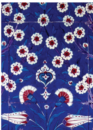
Exquisite Iznik tiles

Day 13: Antalya We discover Antalya’s charming old city (Kaleici) on a morning walking tour through its narrow streets, past historic buildings, mosques, and parks. After lunch at a local restaurant, we visit the acclaimed Archaeological Museum, housing priceless artifacts unearthed from sites. B,L