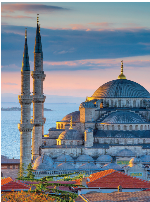
Istanbul’s majestic Blue Mosque

Tonight, we celebrate our Turkish adventure over a farewell dinner together. B,D