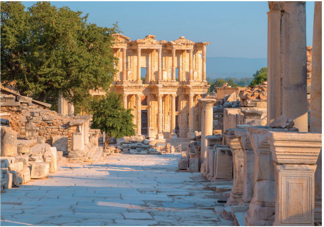
Celsus Library, Ephesus

Day 6: Istanbul/Gallipoli/Canakkale Leaving Istanbul this morning, we travel to the northern Aegean Coast for a brief visit to Gallipoli, haunting site of 31 Allied cemeteries from World War I. Then we ferry across the Dardanelles to Troy, once believed to exist only in Homer’s epic poem until the present site was discovered in the 1870s. After touring here, we continue on to Canakkale, where we spend the night. B,L,D