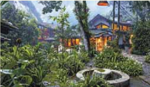
Inkaterra Machu Picchu Pueblo | Machu Picchu