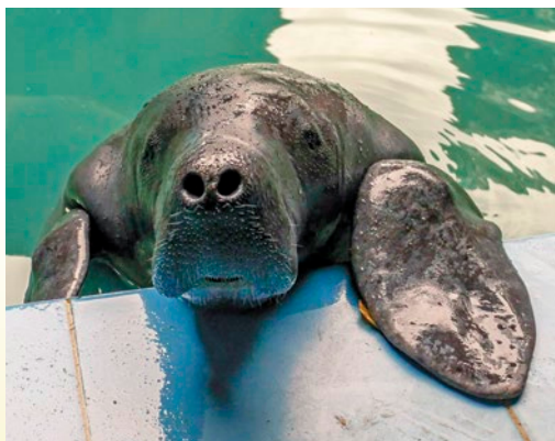
Manatee Rescue Center