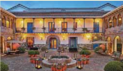
Palacio del Inka | Cusco