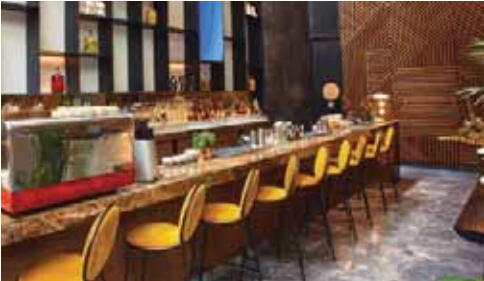
Pullman Lima Miraflores | Lima