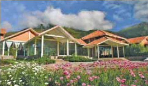
Casa Andina Premium Valle Sagrado | Sacred Valley