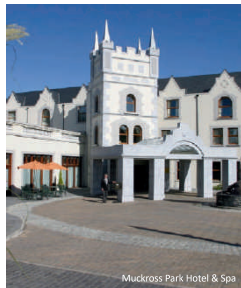
Muckross Park Hotel & Spa

Please note: the order of excursions is subject to change and guided tours are subject to restrictions.