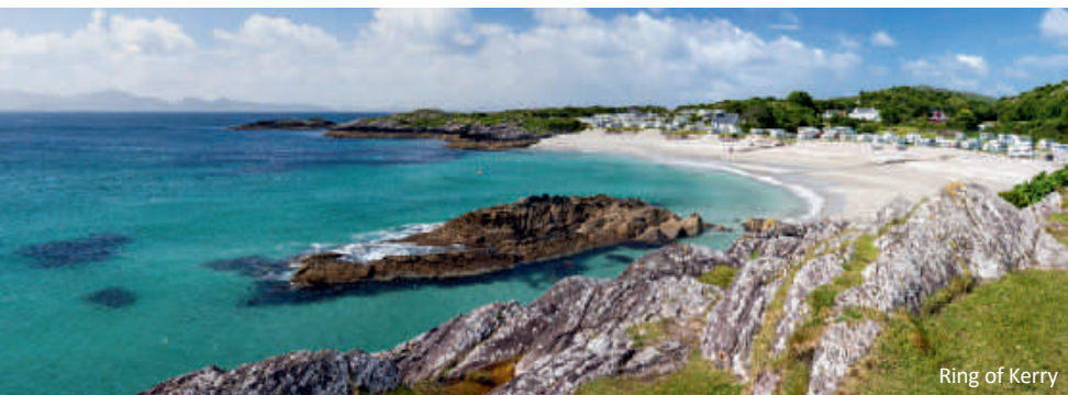
Ring of Kerry

Located on the shores of Lough Leane, Ross Castle is a 15 th -century tower house built by Irish chieftain O'Donoghue Mór (who still slumbers under the gentle waters according to local legend)! It was one of the last strongholds to surrender to Oliver Cromwell's army during the Irish Confederate Wars and is shrouded in folklore today. Here we enjoy a jaunting car ride, horse-drawn carts operated by the local jarvies , as well as a tranquil boat trip on the lake.