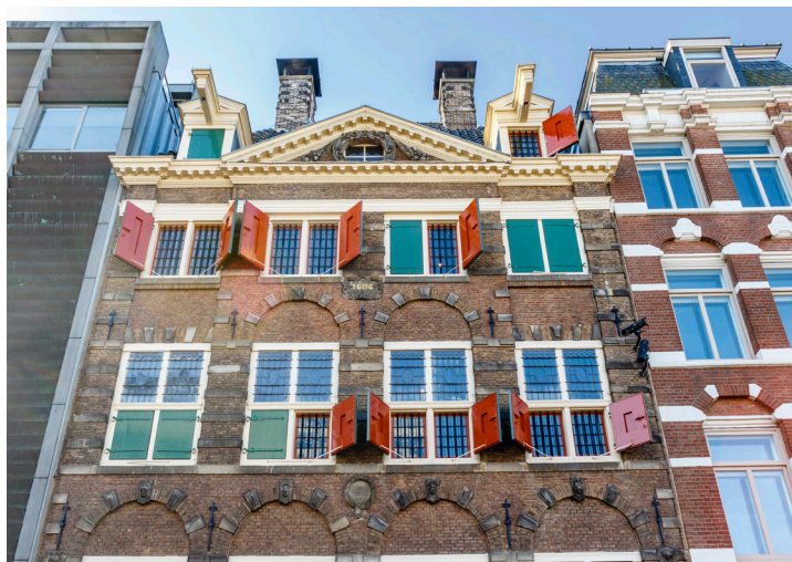
Rembrandt House Museum