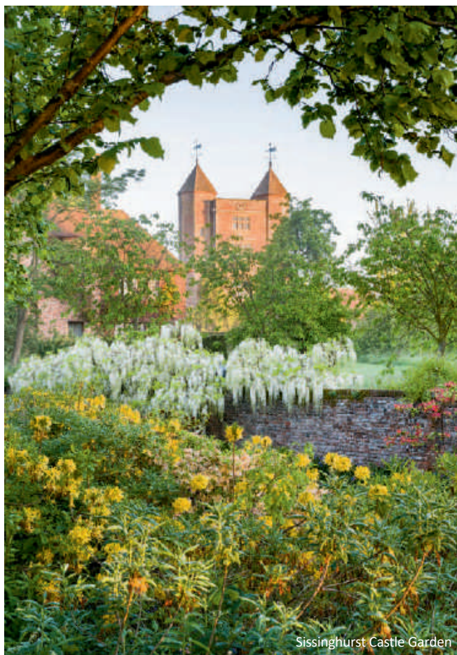
Sissinghurst Castle Garden