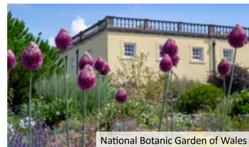
National Botanic Garden of Wales

We begin our day with the National Botanic Garden of Wales, created over 150 years. This spectacular re-interpretation of the historical garden blends the careful restoration of the double-walled garden with Norman Foster's Great Greenhouse, the largest single span glasshouse in the world, where mere panes of glass separate the familiar green hills of Wales from a panoramic sweep of warm, Mediterranean scenery.