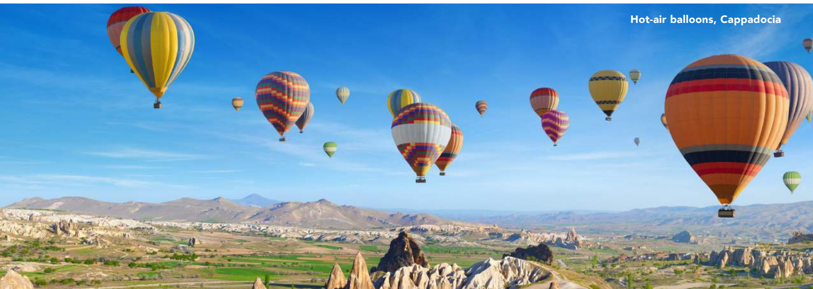
Hot-air balloons, Cappadocia

Following lunch, make your way to the village of Avanos , and spend the rest of the afternoon visiting this ancient village where pottery-making dates back to the Hittites in the 18th century B.C. Feel the smooth red clay shaped by skilled hands, the craft passed down for generations. Return to the hotel in Uçhisar with dinner at leisure. B,L