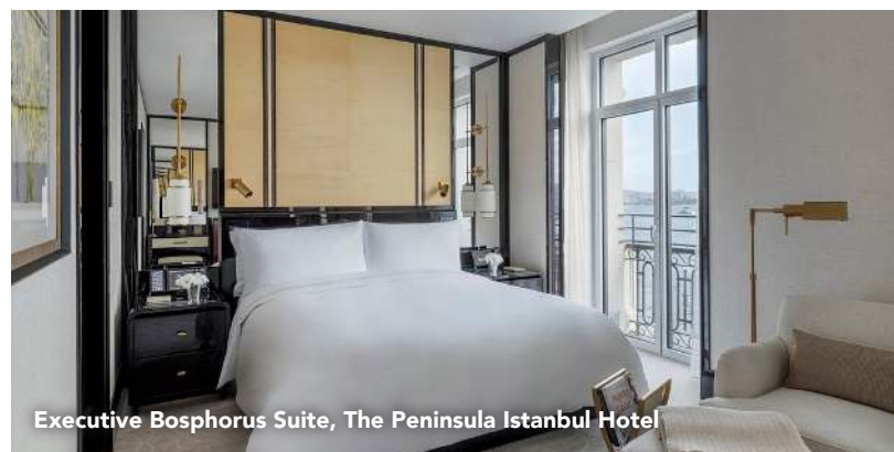
Executive Bosphorus Suite, The Peninsula Istanbul Hotel

Note: The lecturer is scheduled on the main program only.