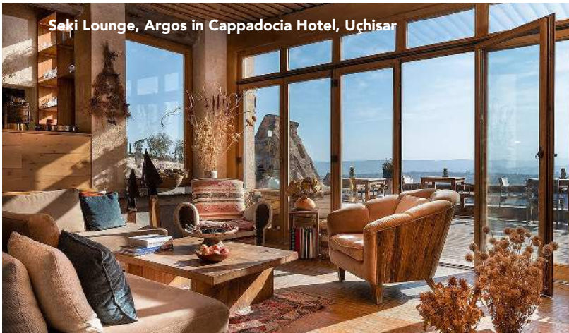
Seki Lounge, Argos in Cappadocia Hotel, Uçhisar