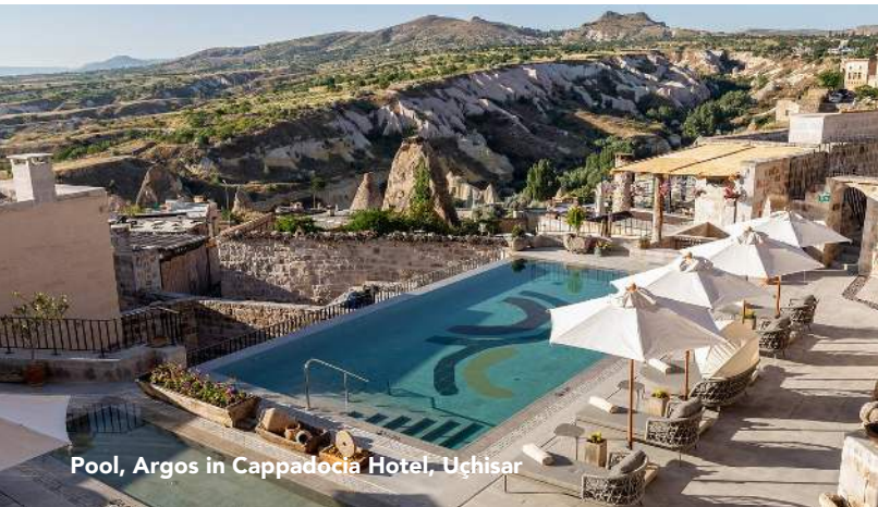
Pool, Argos in Cappadocia Hotel, Uçhisar

This luxurious retreat is set within an ancient monastery, featuring meticulously restored rooms and suites that blend historical charm with modern comfort. Guests can choose from unique accommodations, including traditional cave rooms and splendid suites with private terraces offering stunning views of Pigeon Valley and Mount Erciyes. The hotel boasts an array of amenities, such as an exquisite restaurant serving gourmet Turkish cuisine, a wine cellar housed in a former monastery chapel, an outdoor pool, and beautiful gardens.