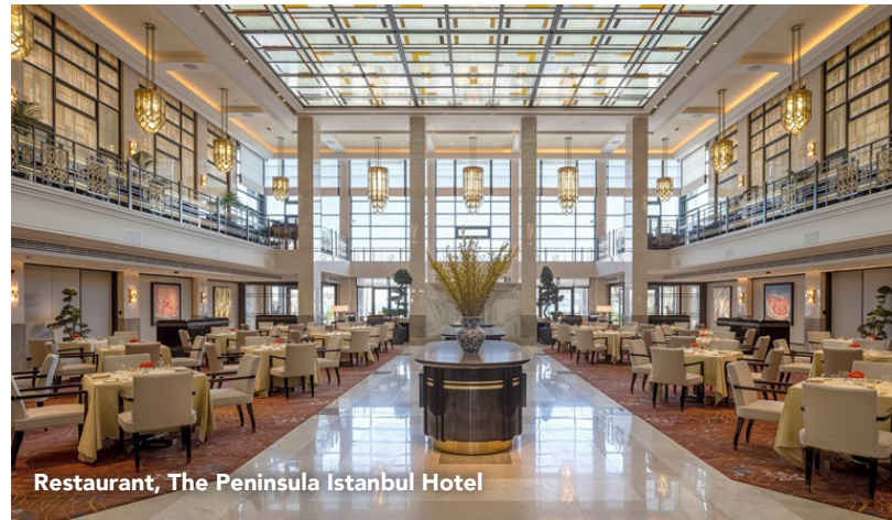
Restaurant, The Peninsula Istanbul Hotel

POSTLUDE RATE $5,299 per person, double rate $6,999 single rate