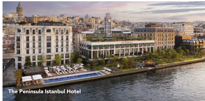
The Peninsula Istanbul Hotel

On the Bosphorus waterfront in Istanbul's historic Karaköy district, this hotel offers rooms and suites with floor-to-ceiling windows and private balconies or terraces with stunning Bosphorus views. Custom furnishings seamlessly blend modern style with traditional Turkish design, complemented by state-of-the-art technology like bedside touchscreen controls and PenChat e-concierge access. Savor all-day Mediterranean-inspired cuisine at the Lobby restaurant, or indulge in sophisticated Turk-Asian fusion dishes at Gallada, the rooftop restaurant with an expansive outdoor terrace overlooking the Bosphorus and lush gardens.