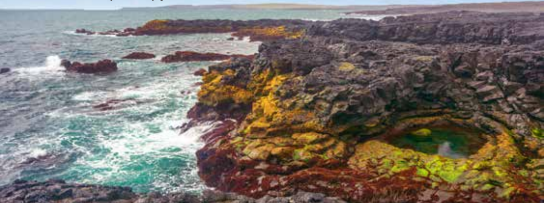
Brimketill natural water pool in Reykjanes Peninsula

Check out of the hotel and enjoy a scenic drive to Akureyri, the "Capital of North Iceland" where you will enjoy lunch in a local restaurant and check in to the Icelandic-style HOTEL KEA. This afternoon, travel to