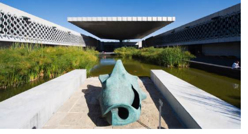
Museo Nacional de Antropología