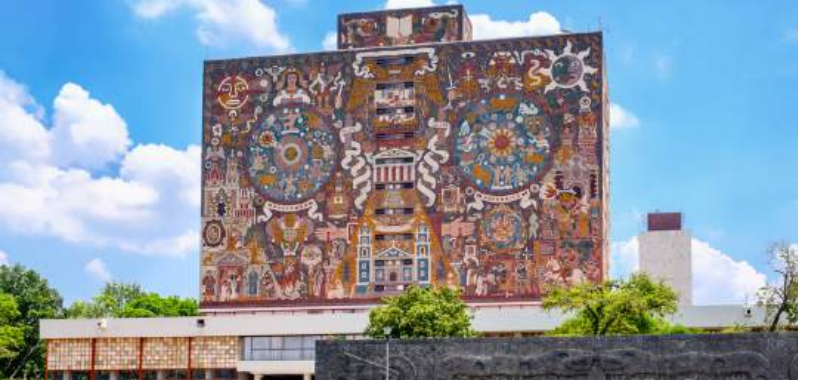
Universidad Nacional Autónoma de México Library

After lunch, take an inside look at the Universidad Nacional Autónoma de México Library (UNAM), a UNESCO World Heritage Site. Built between 1949 and 1952, this architectural gem boasts a façade adorned with murals that chronicle Mexico's history, from the founding of Tenochtitlán to the impact of Spanish colonialism and the nation's modern evolution.