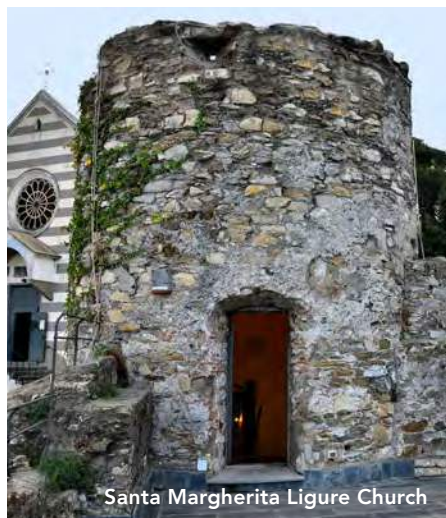
Santa Margherita Ligure Church