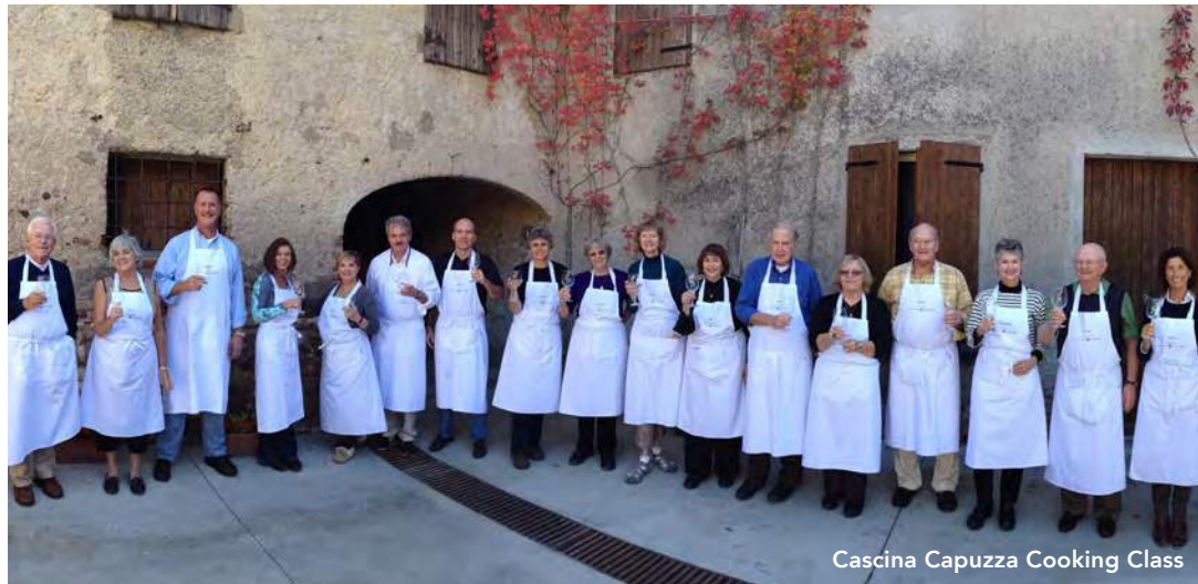
Cascina Capuzza Cooking Class