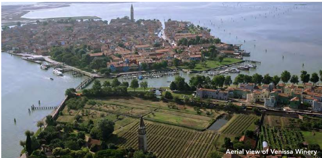
Aerial view of Venissa Winery