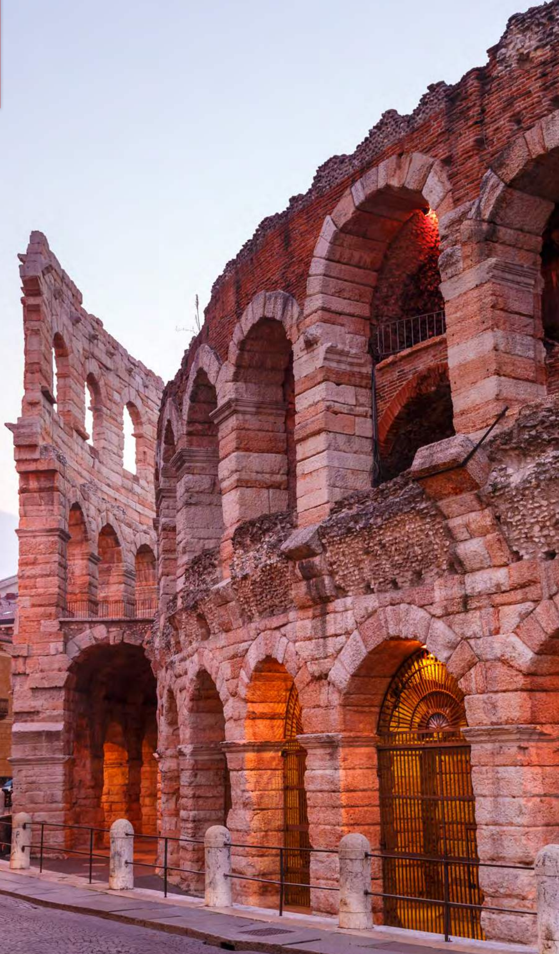
Colosseum Arena di Verona