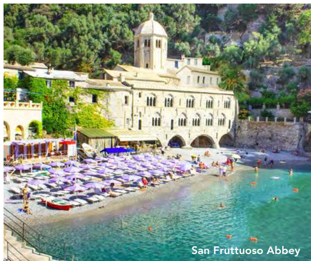
San Fruttuoso Abbey