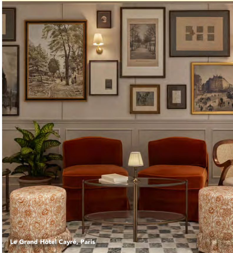
Le Grand Hôtel Cayré, Paris