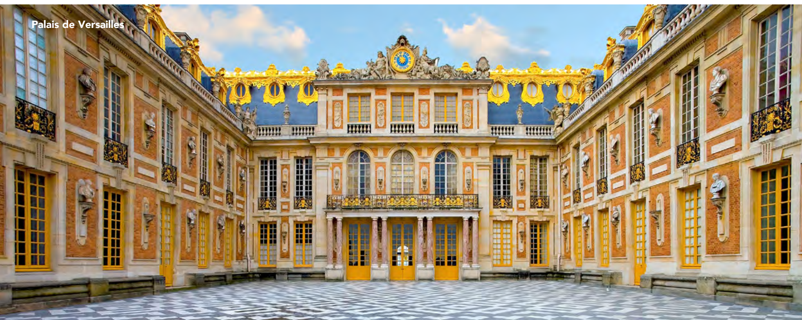
Palais de Versailles

A short distance away, enter the Hameau de la Reine , Marie Antoinette's countryside retreat. Built to resemble a Norman village, this collection of ten thatched-roof cottages surrounds a quiet lake. Pass the Mill, the Marlborough Tower, and the Guardian's House, where the queen escaped court life to embrace an idealized vision of rural simplicity.