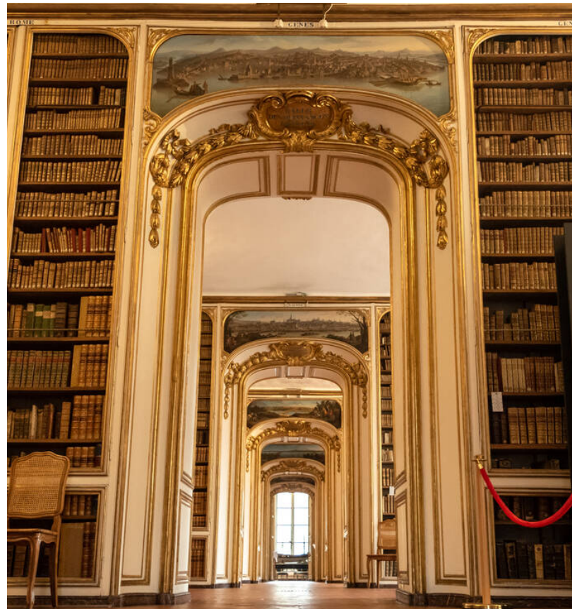
Bibliothèque Municipale de Versailles, photo © Christophe Foun

Venture outside Paris for an inside look at the grand Palais de Versailles . Take a private tour of the Bibliothèque Municipale de Versailles , once Louis XVI's Ministry of Foreign Affairs. Completed in 1762, this elegant 18th-century residence was the backdrop for critical diplomatic negotiations, including the 1763 Treaty of Paris, which ended the Seven Years' War. Admire its original decorative woodwork, paintings, and five opulent rooms.