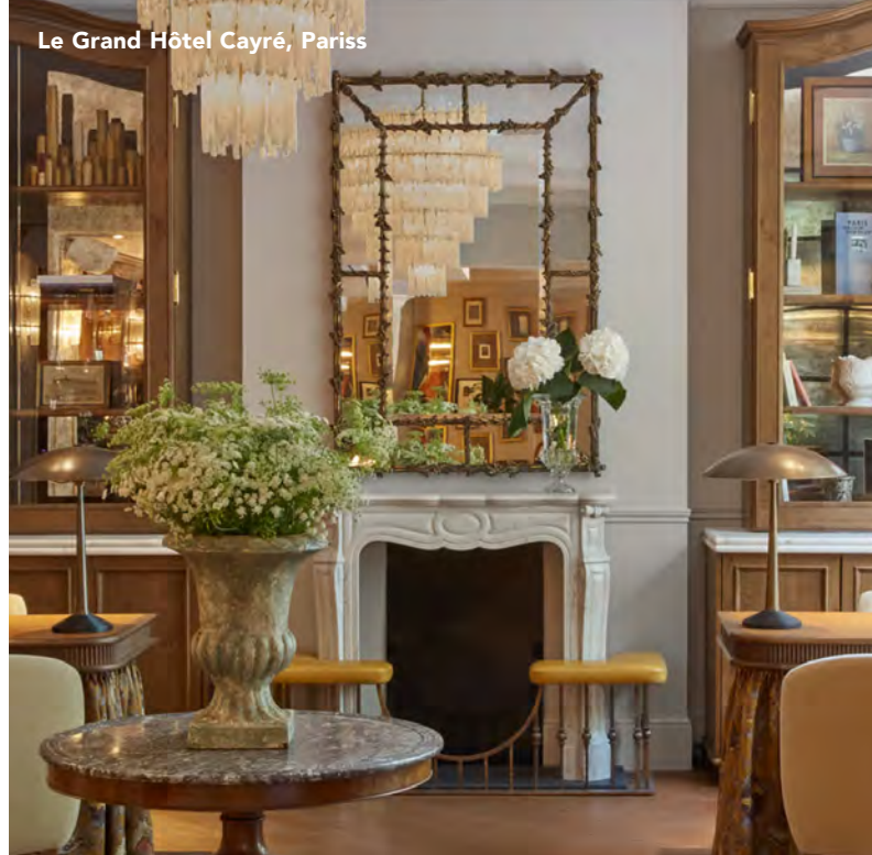
Le Grand Hôtel Cayré, Paris

To secure your place, please call National Trust Tours at 888-484-8785.