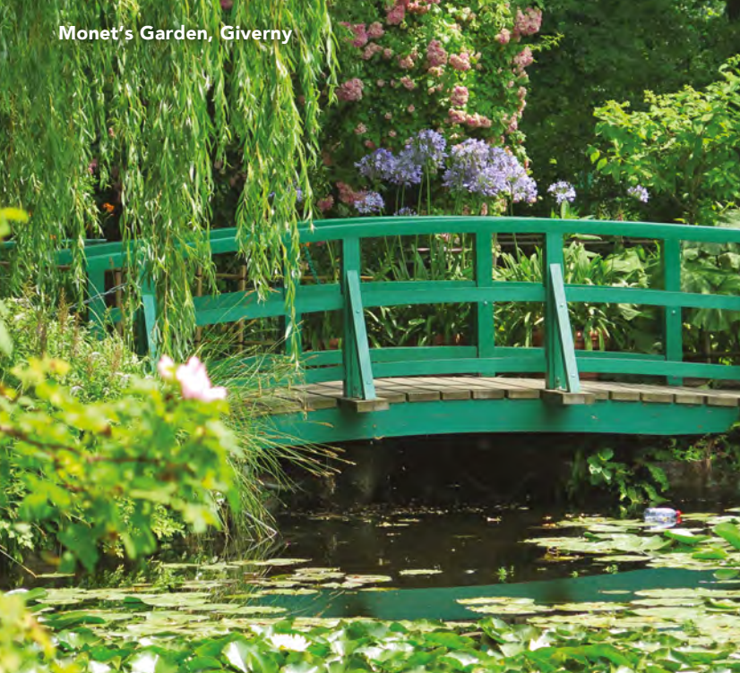
Monet's Garden, Giverny