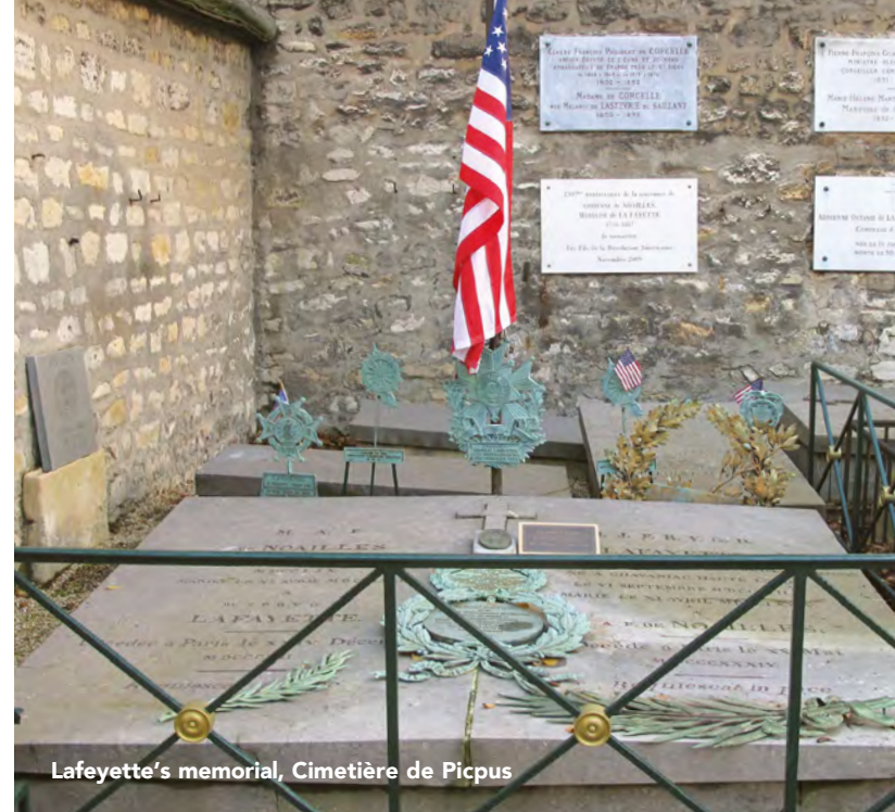
Lafayette's memorial, Cimetière de Picpus

At the Grand Trianon , an opulent retreat built for Louis XIV, view the Mirror Room , where he conferred with his inner circle. Nearby, the Petit Trianon , originally commissioned by Louis XV, later became Marie Antoinette's private haven within her gardens. Dinner this evening is at leisure. B,L