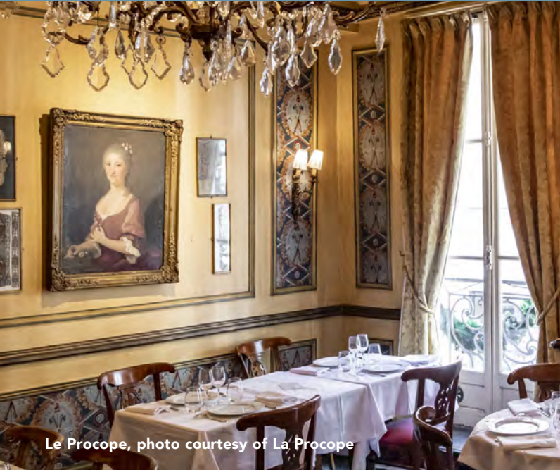
Le Procope