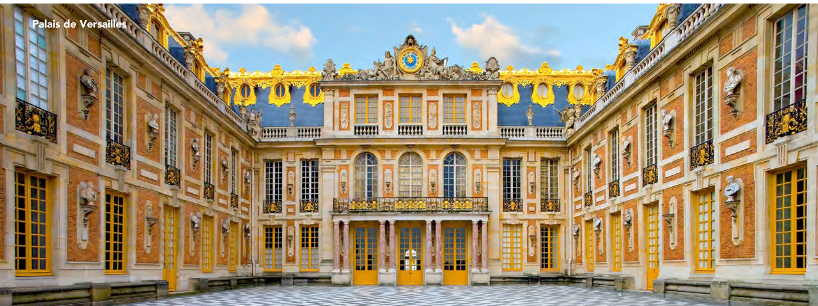
Palais de Versailles

A short distance away, enter the Hameau de la Reine , Marie Antoinette's countryside retreat. Built to resemble a Norman village, this collection of ten thatched-roof cottages surrounds a quiet lake. Pass the Mill, the Marlborough Tower, and the Guardian's House, where the queen escaped court life to embrace an idealized vision of rural simplicity.