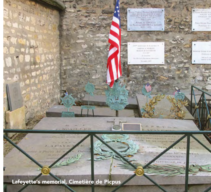
Lafayette's memorial, Cimetière de Picpus

At the Grand Trianon , an opulent retreat built for Louis XIV, view the Mirror Room , where he conferred with his inner circle. Nearby, the Petit Trianon , originally commissioned by Louis XV, later became Marie Antoinette's private haven within her gardens. Dinner this evening is at leisure. B,L