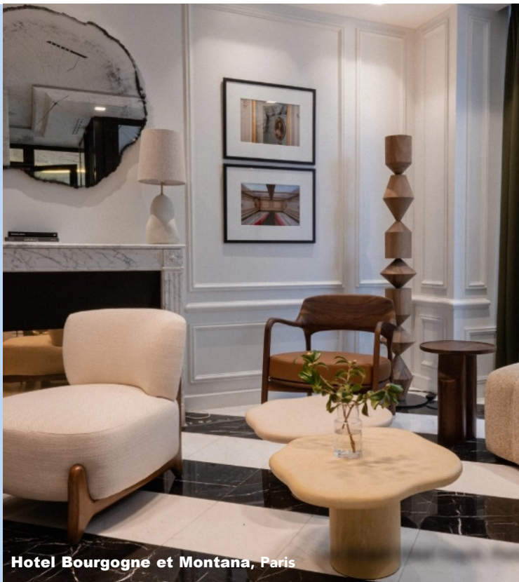
Hotel Bourgogne et Montana, Paris