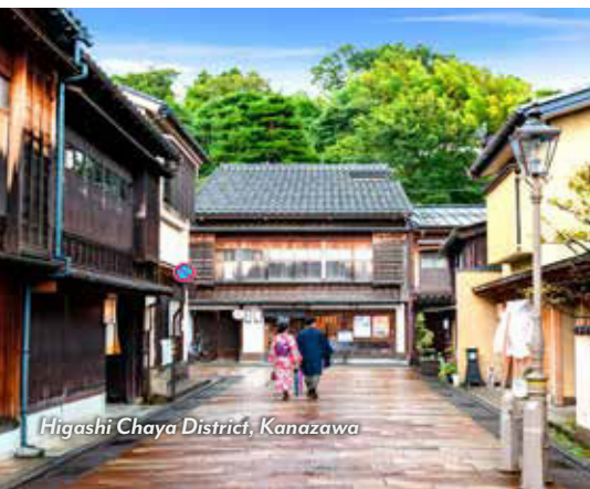
Higashi Chaya District, Kanazawa

Explore UNESCO-inscribed Hagi, a well-preserved