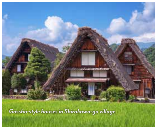
Gassho-style houses in Shirakawa-go village