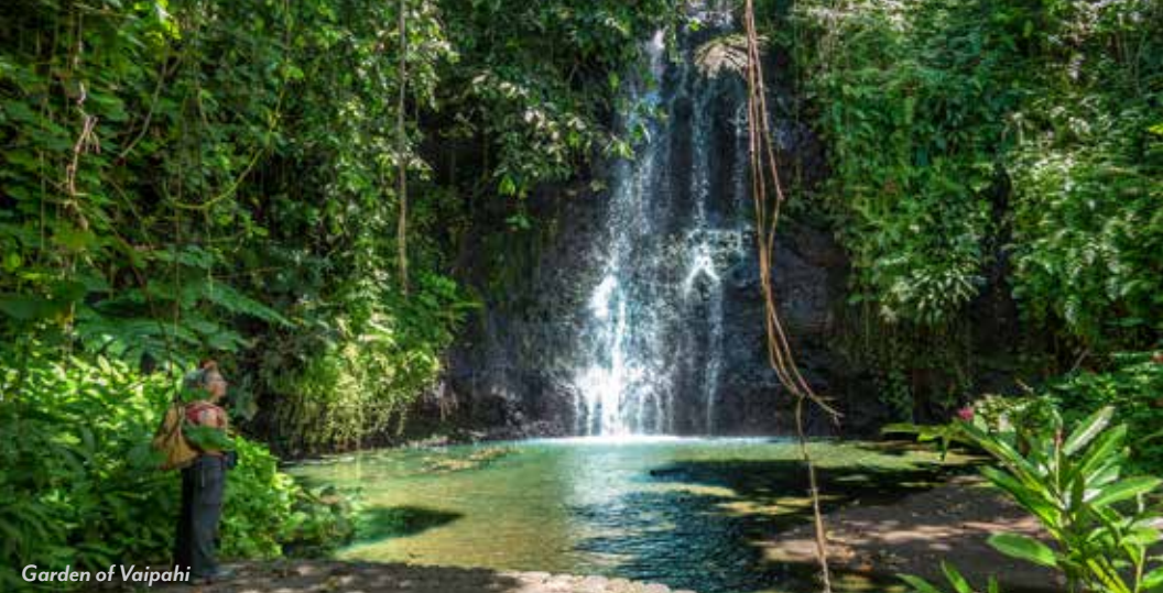
Garden of Vaipahi

and trees. You can also opt to tour the grounds of a vanilla plantation, which includes time to snorkel and potentially encounter stingrays. Next, dig your bare feet in the sand and savor an included beach barbecue lunch on a private motu, where you can also swim, snorkel or kayak. (B,L,D)