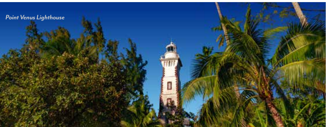
Point Venus Lighthouse

Spend time at leisure on this low-key island or choose an optional excursion to discover the traditional use of local plants