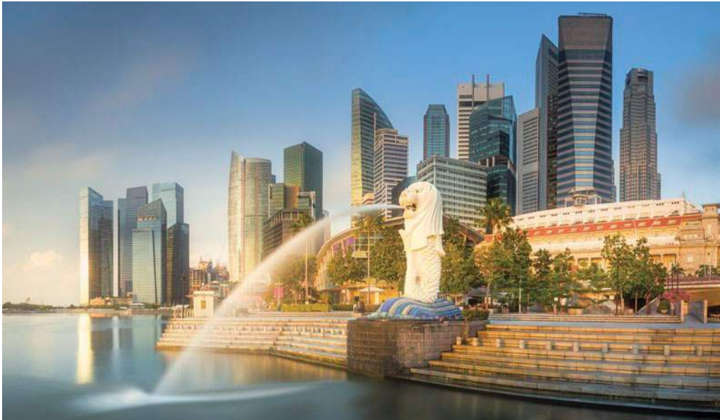
Merlion Park, Singapore

Depart gateway city for Singapore. 🌐 Cross the international date line.