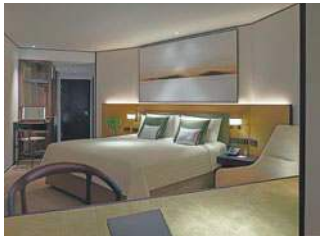
Shangri-La Singapore | Singapore