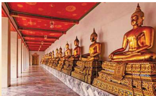
Emerald Buddha Temple, Bangkok

AHI Connects | Local Life. Engage with a Cambodian family while making rice noodles.