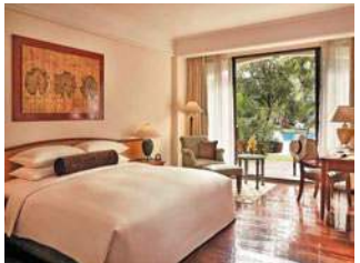
Sofitel Angkor Phokeethra Golf & Spa Resort | Siem Reap, Cambodia