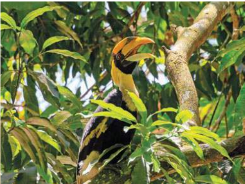
Great hornbill, Taman Negara National Park