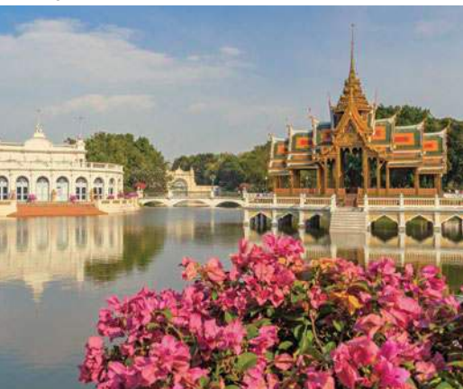
Bang Pa-In Palace

🕒 Elective | Sala Rim Naam. Join an evening immersed in Thai culture to experience a Thai dance show and a dinner of classic dishes.